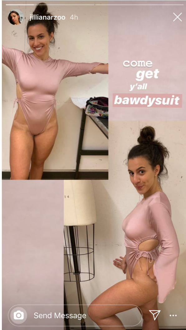
Look 1: Pink Body Suit with pink Glitter hat and Glitter Boots