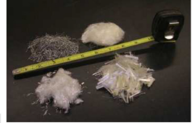
Fig. 5.2.2—Examples of fibers used to control shrinkage cracking.