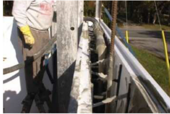
Fig. 5.1.1—Reusable formwork for a wall panel