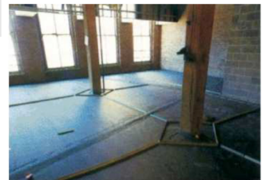
Fig. 5.2.3—Crack control strips.