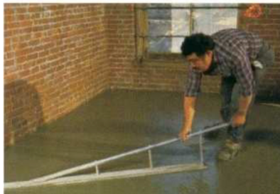
Fig. 5.2—Finishing a cellular concrete floor.