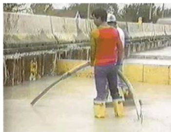
Fig. 5.1.2—Flowability of cellular concrete (video courtesy of Elastizell).