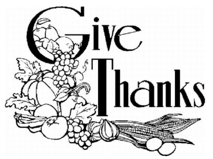
Happy Thanksgiving Nov. 28th

To Pastor Marv for all the things that you do for both churches that are above and beyond your normal "duties". (Because we all know you only work one day a week!)