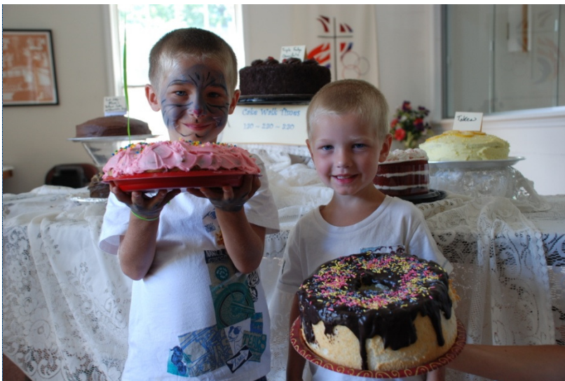
Very happy cake walk winners at Advent's 30 th Anniversary Festival.

An ELCA Congregation in the Heart of the Monadnock Region ■ October 2013 Issue