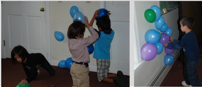
Parting the "waters" of the Red Sea.

After eating their fill, the kids played Moses-themed games. In Parting the Red Sea (photos at left), two teams rushed to stick as many balloons to their wall as possible – a great way to work off all that maple syrup before the church service. (The kindergartners won.) ■