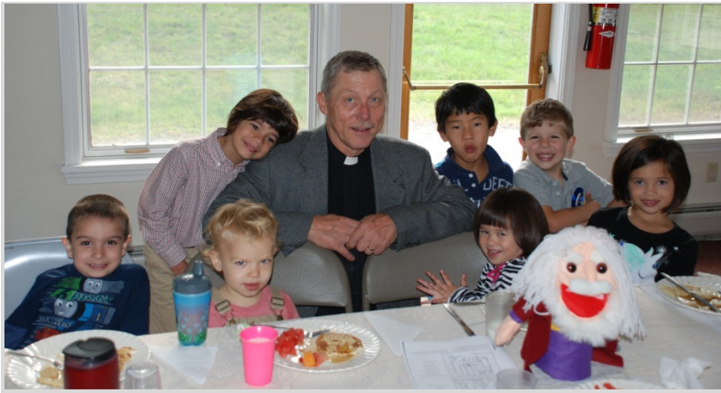
Who's ready for pancakes?