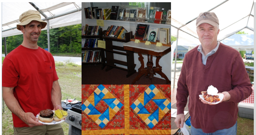
Hand-formed patties grilled to order and homemade fruit pies almost sold out at the May Fair, while attendees browsed for local crafts and used books.

An ELCA Congregation in the Heart of the Monadnock Region ■ Late Summer 2014 Issue