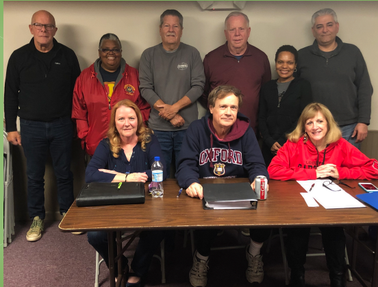
Front Row L-R

Our Annual Meeting was held on Sunday evening November 17th at the Chenoweth Woods Apartments. Reports of officials and committees were given. The slate of directors was elected.