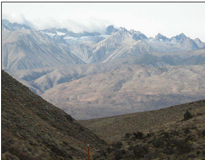
Chilly view from Black Canyon Loop

Anthony Agoni submitted the following spectacular photos: