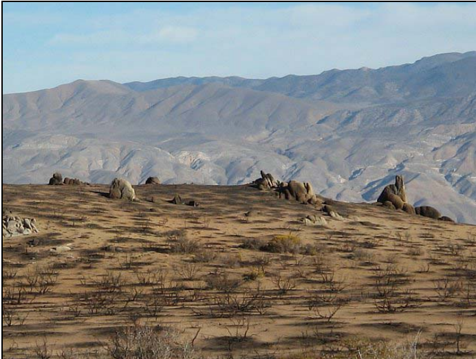
Gorgeous scenery from Coyote Loop moonscape