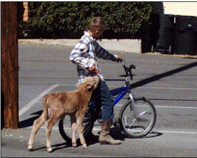
Is walking your calf a common sight in Bishop?