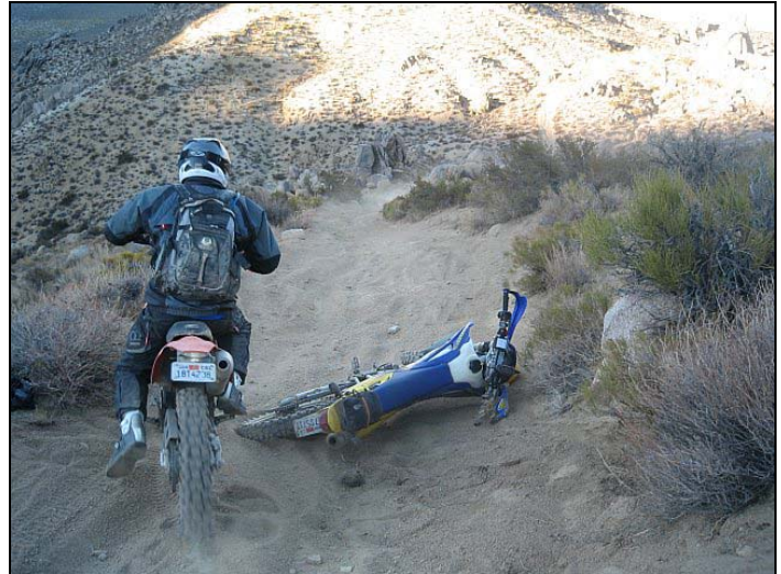
Very steep, sandy downhill section on Coyote Loop