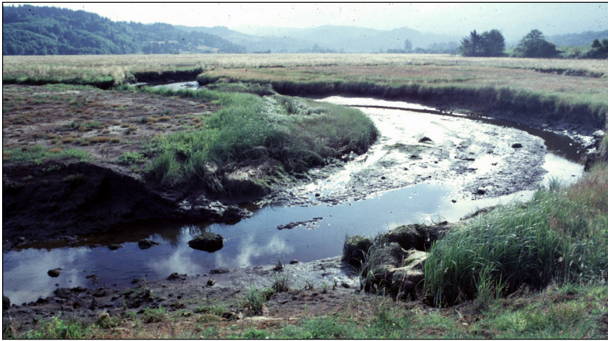
Restoring highly disturbed habitats results in a fuller expression of salmon life histories.

Using this portfolio of habitats in opportunistic ways is encoded in the DNA of salmon