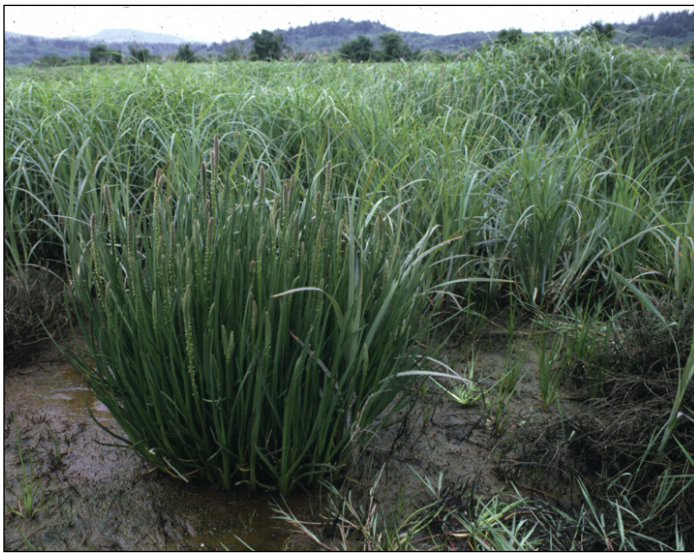
Plant species diversity decreased but above-ground productivity increased in the restoring marshes.

Having an “all-you-can-eat buffet” at this stage of their lives is important for young salmon, as research shows that adding weight and size before they enter the sea directly improves their chances of survival in the ocean. In addition, the continual mixing of fresh and salt water in estuaries offers young salmon a place to gradually acclimatize and adapt to the demands inherent in switching their biological and metabolic engines from a life immersed in freshwater to one immersed in the sea—a transition that some fisheries biologists liken to undergoing chemotherapy. And new research suggests that the ocean’s ebb and flow in and out of estuaries helps these young fish become attuned to the cycles and currents of the sea, as well as