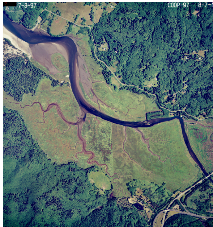
A 1997 aerial photograph of the estuary and marshes shows the major side-channels.