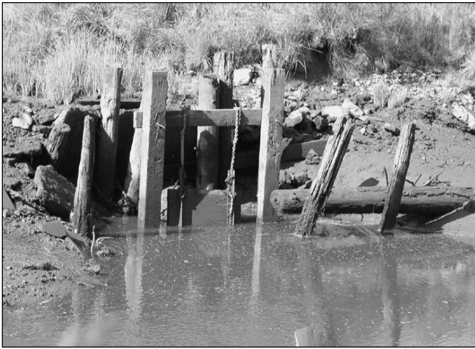
Tidegates, such as this, are historically one of the tools used to convert estuaries for agriculture. In Pacific Northwest estuaries, between 50 and 90 percent of wetlands have been converted to commercial and residential as well as agricultural uses.

aries and coastal wetlands, are being transformed rapidly by urban development and agriculture. According to the National Ocean Service, the United States has lost over 6 million acres of coastal wetlands since Europeans first settled here. In coastal states, about 55 million acres of tidal wetlands have been damaged or destroyed. 2 And in Pacific Northwest estuaries, from 50 to 90 percent of wetlands have been converted to commercial, agricultural, and residential uses. 3 As human population grows in coastal areas, estuaries and coastal wetlands continue to be filled, dredged,