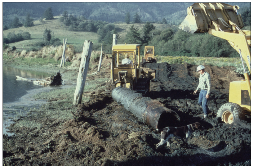
Tidegate removal on Salmon River.