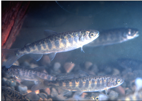
Using a portfolio of habitats in opportunistic ways is encoded in the DNA of salmon.