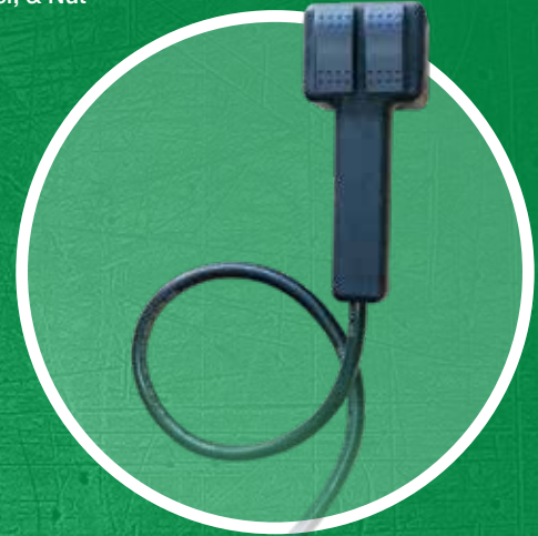
Hand Held Universal Electrical Control Kit