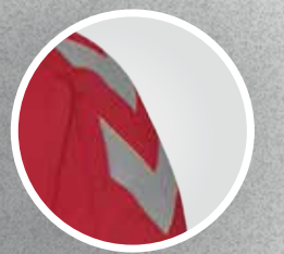
Gedruckte, texturierte Winkel mit 3D-Effekt