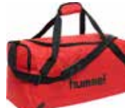
3081 TRUE RED/BLACK