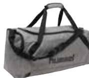
2006 GREY MELANGE