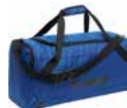
7079 TRUE BLUE/BLACK