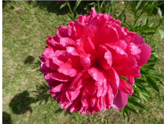
Peony, the Pentecost Rose, a gift of healing