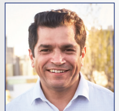
Congressman Jimmy Gomez

For more information on how to vote visit www.JesseForAssembly.com/vote