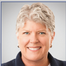
Congresswoman Julia Brownley