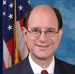
Congressman Brad Sherman