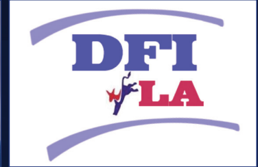
Democrats for Israel Los Angeles