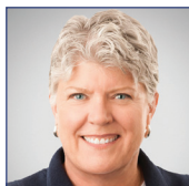
Congresswoman Julia Brownley