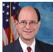
Congressman Brad Sherman