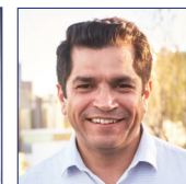
Congressman Jimmy Gomez