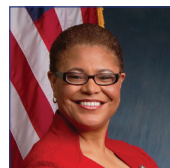
Congresswoman Karen Bass