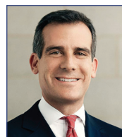
L.A. Mayor Eric Garcetti