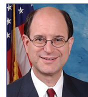
Congressman Brad Sherman