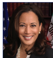
Senator Kamala Harris

Endorsed by Organizations and Leaders We Trust