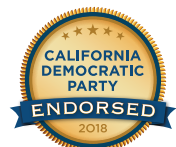
California Democratic Party