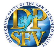
Democratic Party of the San Fernando Valley