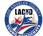
L.A. County Young Democrats