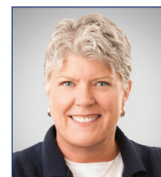
Congresswoman Julia Brownley