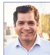
Congressman Jimmy Gomez