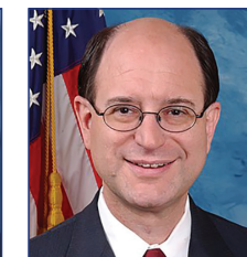
Congressman Brad Sherman