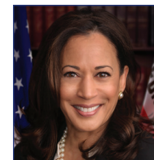
Senator Kamala Harris