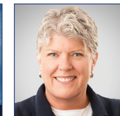
Congresswoman Julia Brownley

On June 5th, vote Jesse Gabriel for State Assembly