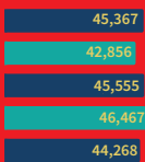
TOTAL THEFTS BY YEAR