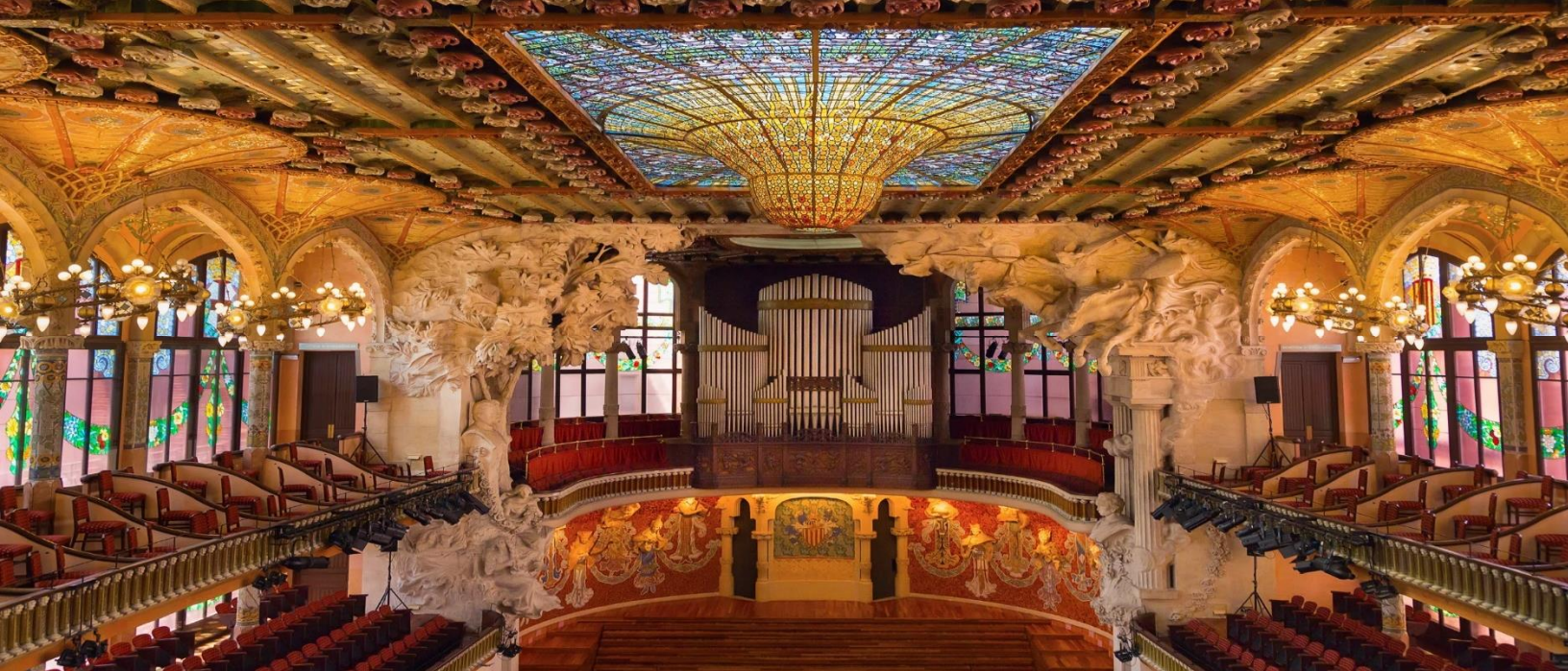
The Palau de la Música Catalana, Barcelona

“At the age of six I wanted to be a cook. At seven I wanted to be Napoleon. And my ambition has been growing steadily ever since.” Salvador Dalí