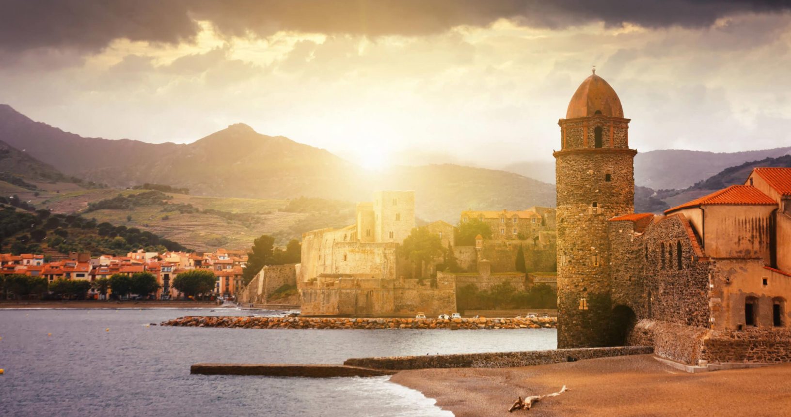
Relax in the arty seaside town of Collioure

After lunch, Miró enthusiasts will enjoy the Joan Miró Foundation which was designed by Josep Lluís Sert. The great architect created a space which offers visitors a moment of calm and beauty where light and beauty interact in perfect harmony. Upon entering the museum you'll discover the work of another Picasso contemporary, Joan Miró, who throughout his life took a particular interest in the diversity of materials, forms and colors. It led him to explore and experiment with different art forms such as painting, sculpture, printing techniques, ceramics, theatre and tapestry. For those with a bit of energy, we suggest a visit to the Ceramics Museum of Barcelona where you'll find 16 ceramic works by Picasso. Or you may wish to visit the National Art Museum of Catalonia or the Museu d'Art Contemporani de Barcelona.