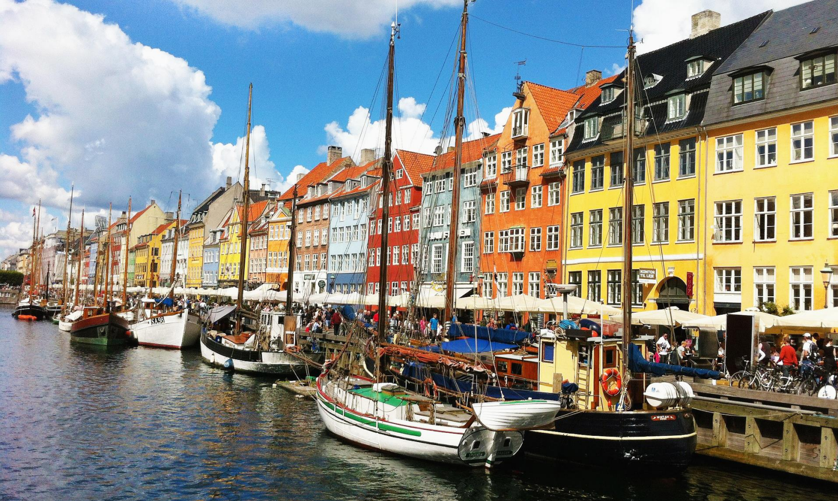
Stroll through Copenhagen's colorful old harbor