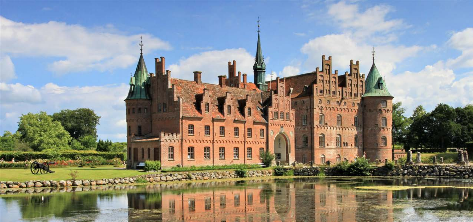
Discover the castles of Denmark!

“Life itself is the most wonderful fairy tale.”