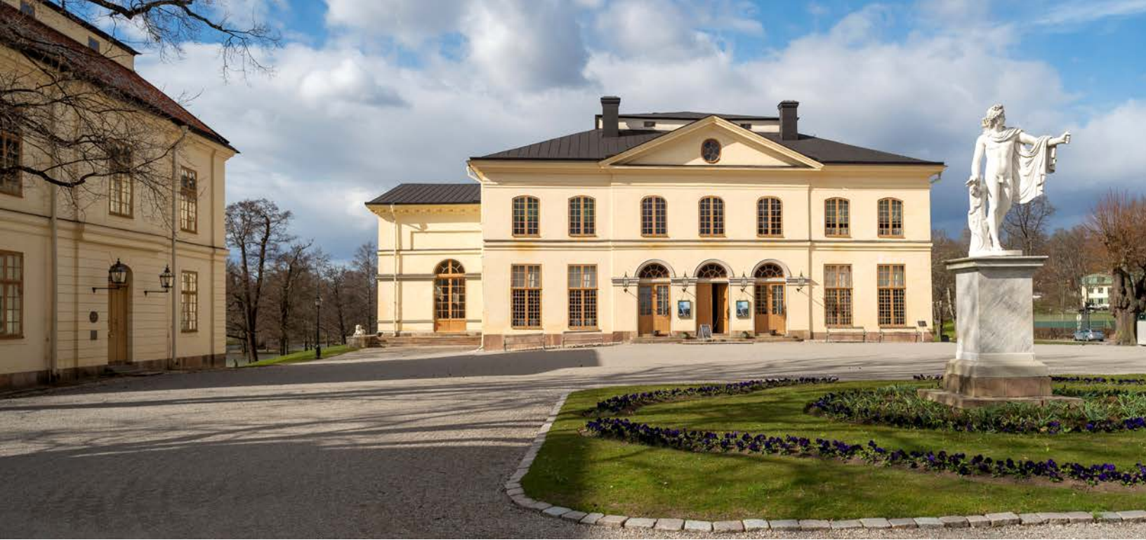
Tour Royal Palace, Stockholm.