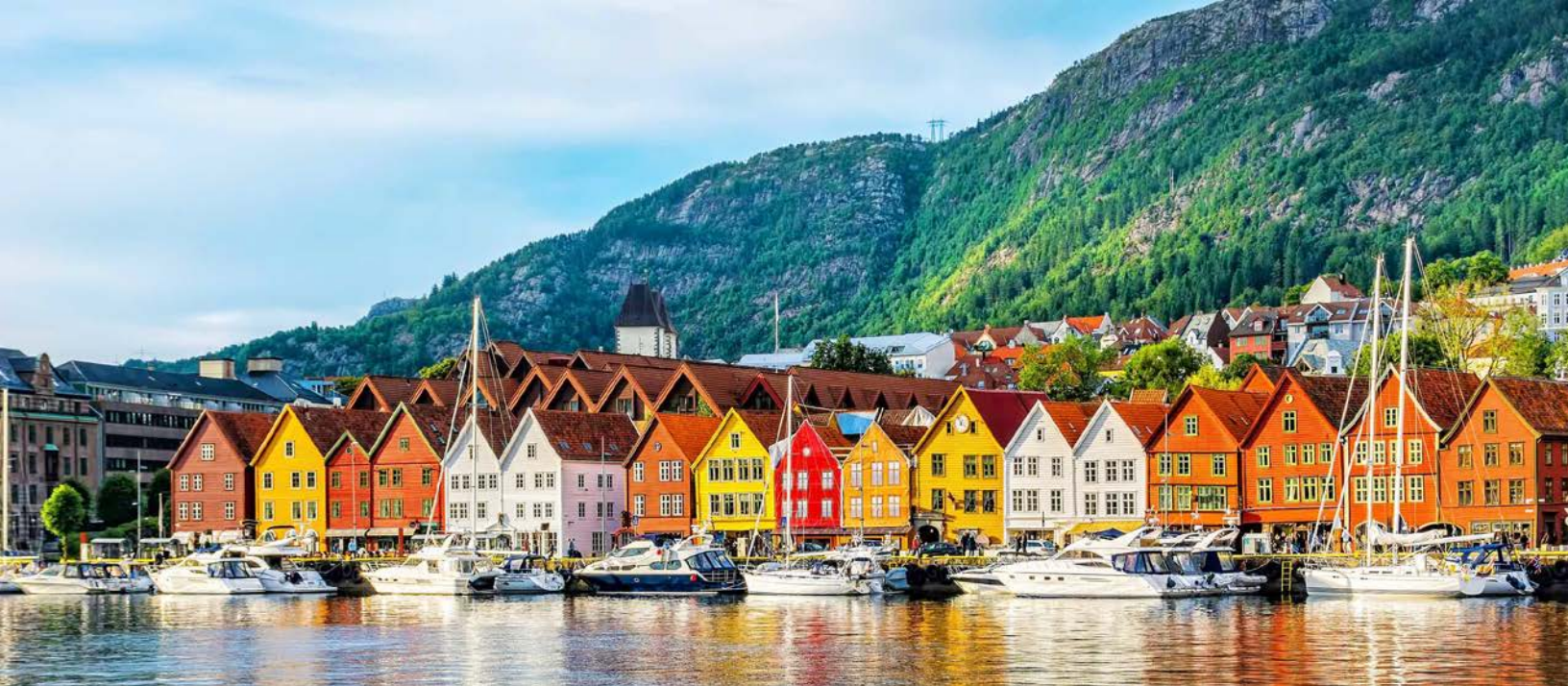
Explore Bergen, Norway