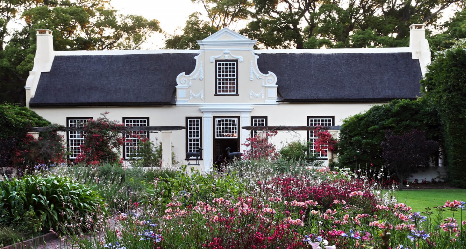
Vergelegen gardens and Estate