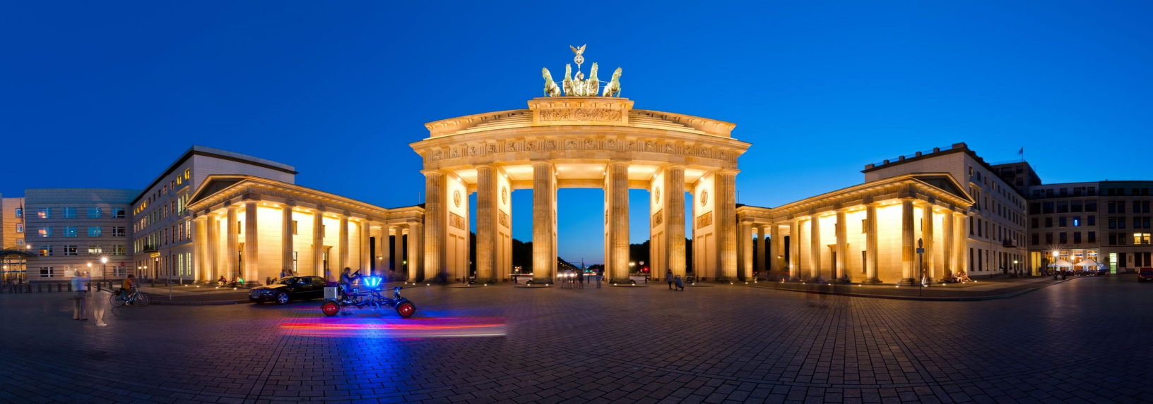
Unter den Linden, Brandenburg Gate