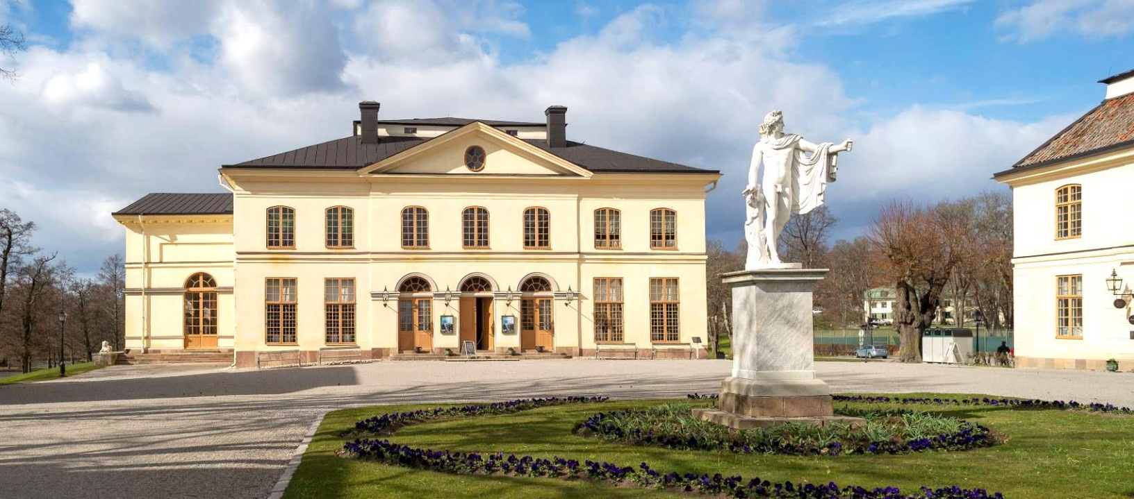
Tour the 18 th century Drottningholm Palace Theatre

“Life itself is the most wonderful fairy tale.”