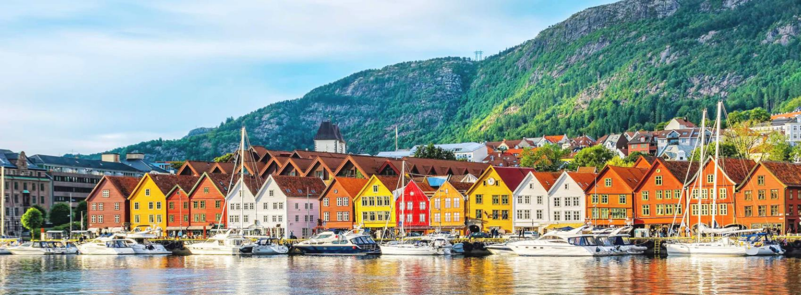
Discover the Beauty of Bergen, Norway