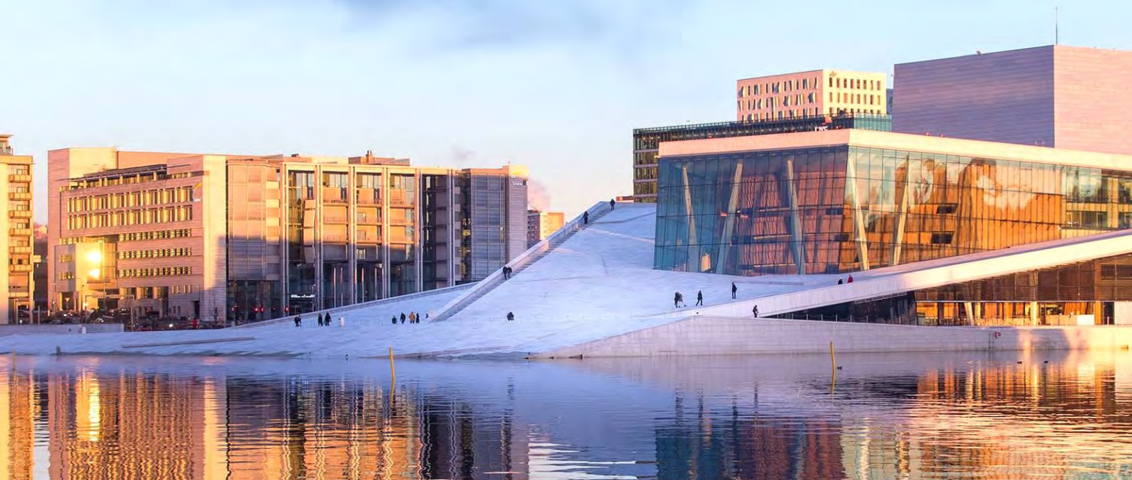
Enjoy a backstage tour of Oslo's Opera House