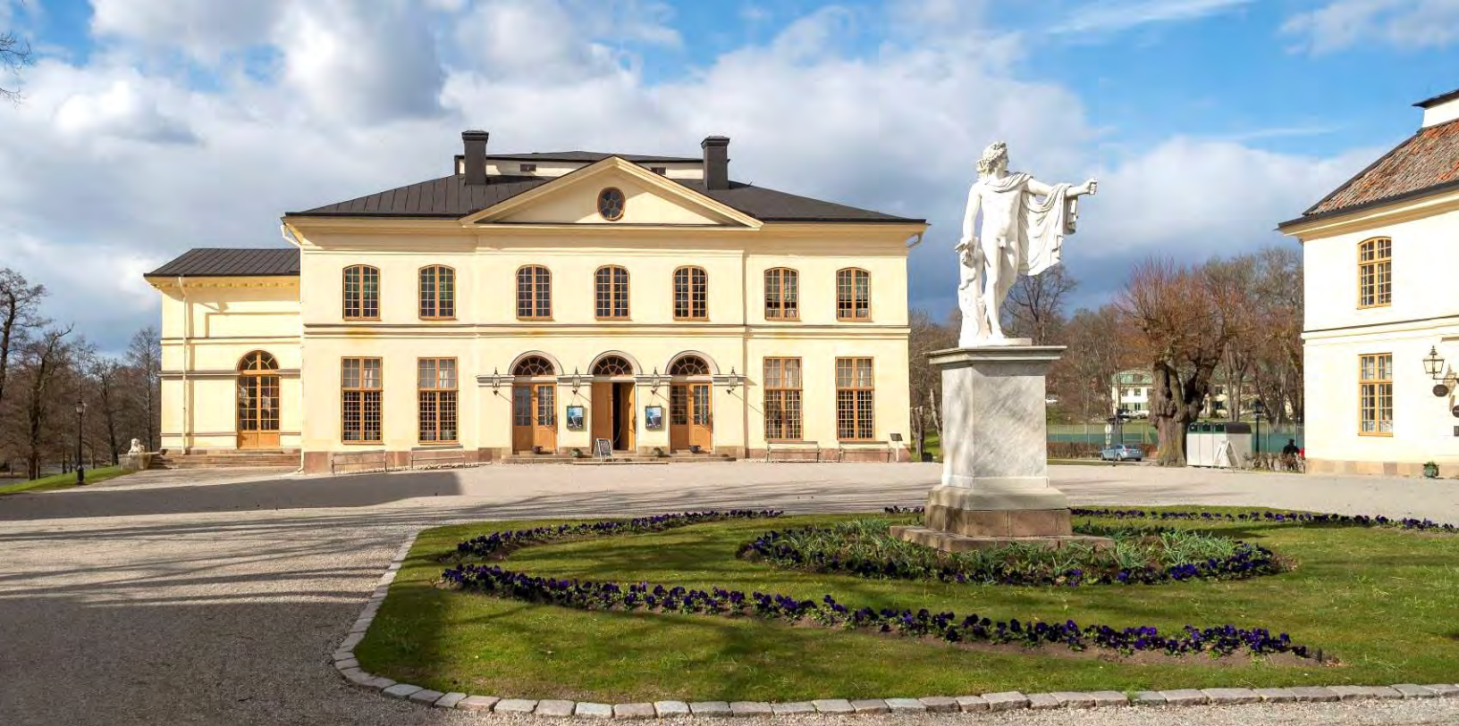
Attend a classical concert at the Royal Palace, Stockholm