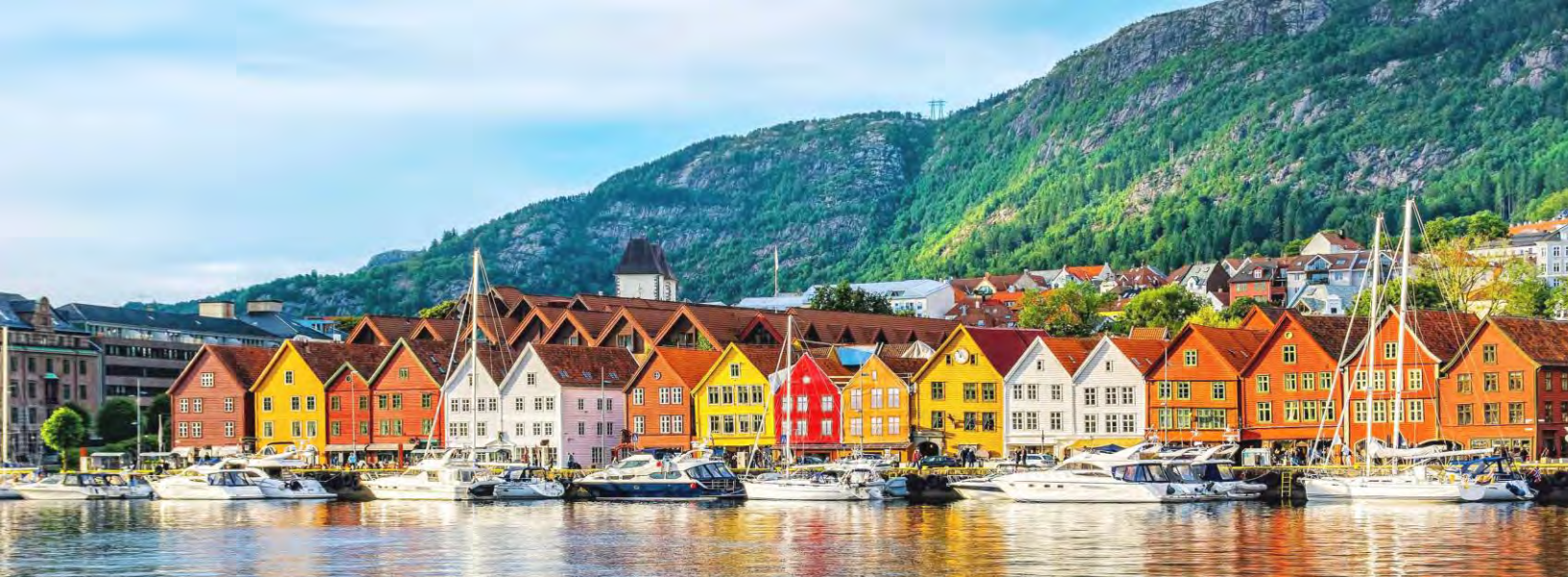
Discover the Beauty of Bergen, Norway

Enjoy free time this morning to enjoy the many sights of Oslo. We suggest a visit to the Fram Polar Ship Museum or the Edvard Munch Museum. This afternoon meet your fellow travelers for an exclusive tour of the Norwegian National Opera House. Sleep in Oslo (B, L)