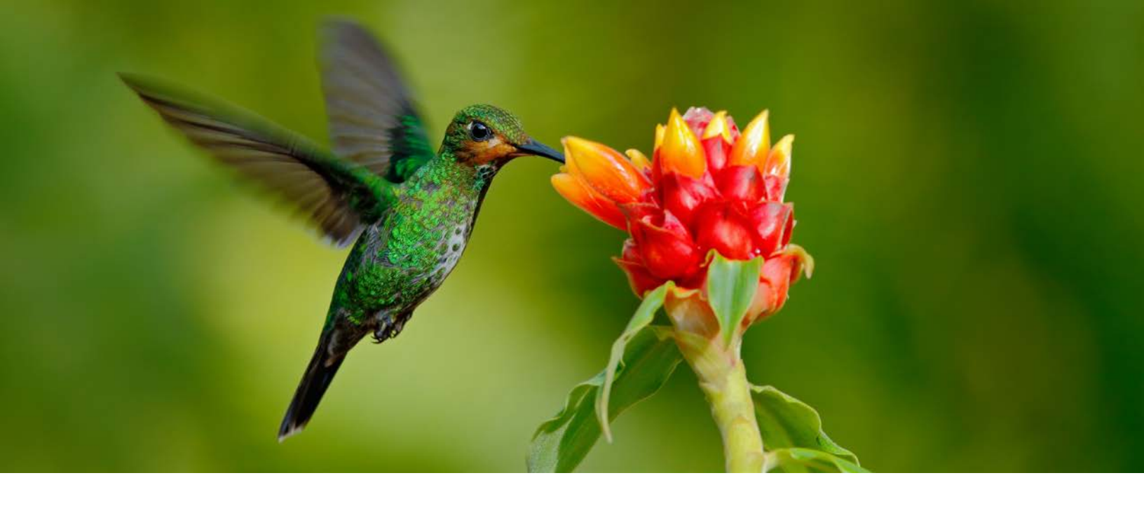
FACT Although Costa Rica lacks an army, it claims over 830 species of birds.