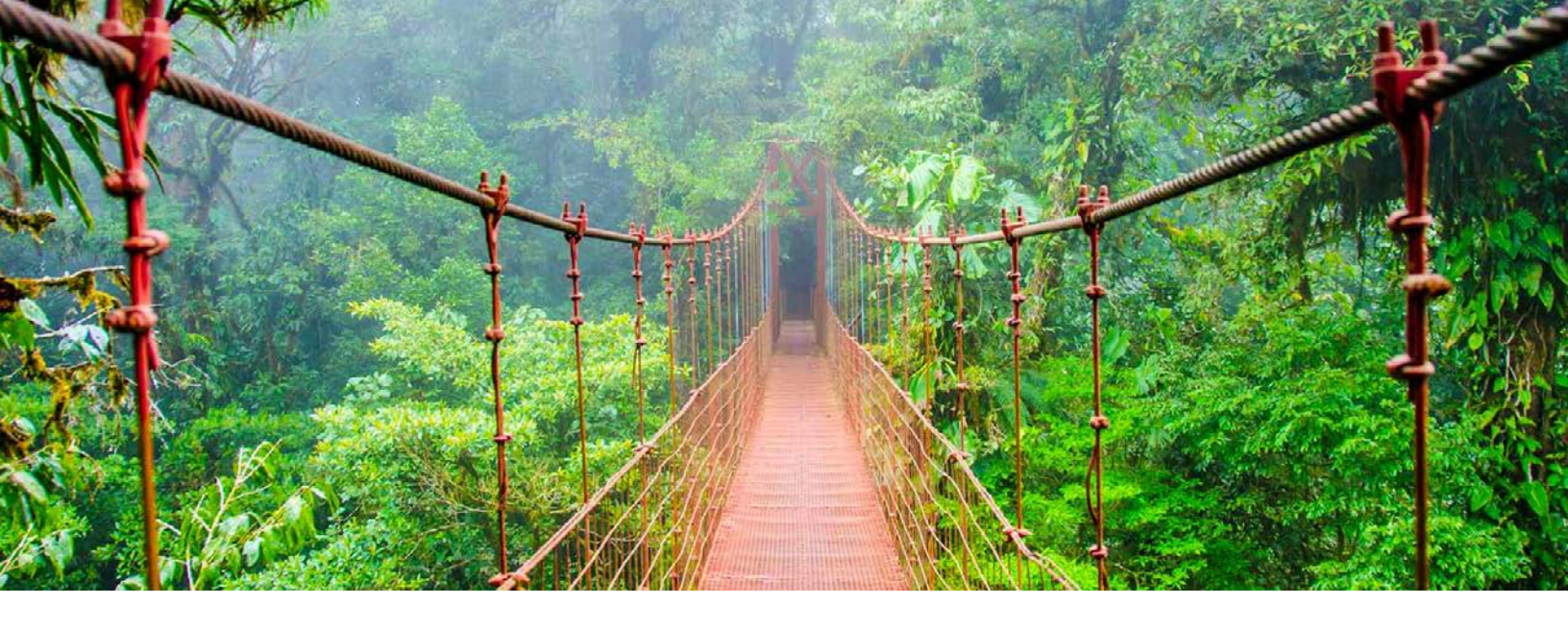
FACT Costa Rica boasts more than 9000 species of flowering plants and about 800 species of ferns.

Day 2: Tuesday, February 18 - Monteverde Cloud Forest & Butterfly Gardens Following breakfast, we'll say "adios" to San Jose and make our way to the renowned Cloud Forest of Monteverde. Our picturesque drive will take us through the Central Valley over the continental divide. Making a number of stops where the scenery is at its best, we end our drive at Monteverde itself. Due to its high altitude - some 4,662 ft above sea level - Monteverde is privileged to receive a steady supply of clouds and the life-giving moisture that they contain. This moisture, often in the form of fog, catches on the branches of the tallest trees and drips down to the other organisms below. This helps to support a complex and far-reaching ecosystem, one that harbors over 100 species of mammals, 900 species of birds, tens of thousands of insect species, and over 2,500 varieties of plants, 420 of which are orchids. After checking into our mountain lodge, we visit the Monteverde Butterfly Garden where you'll get a closer look at these fragile creatures and a few of their less lovely friends. Time permitting, we'll join your guide this evening for a sunset bird-watching walk and spend the next three nights in the midst of the Cloud Forest. Sleep in Monteverde (B, L, D)