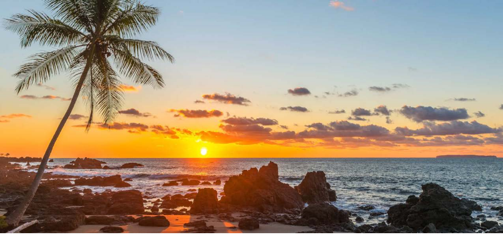
Day 7: Sunday, February 23 - South to Manual Antonio National Park

After breakfast we make our way to the Pacific Coast where we'll dine this evening on seafood specialties. Along the way, we'll stop to view some of the largest crocodiles in Central America. Sleep near Manuel Antonio National Park (B, L, D)