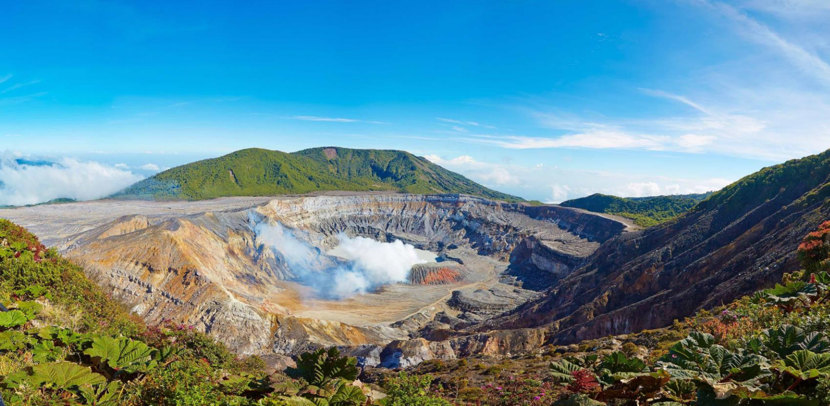
Discover Poas National Park

Today we set out to explore the Central Valley. Our first stop will be a coffee plantation. It's harvest time, so we may have the opportunity to participate in the harvest!