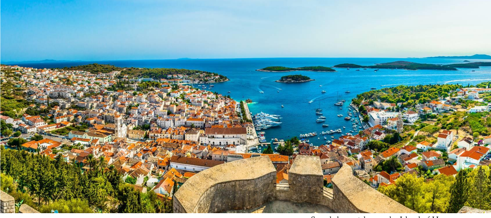
Spend three nights on the Island of Hvar