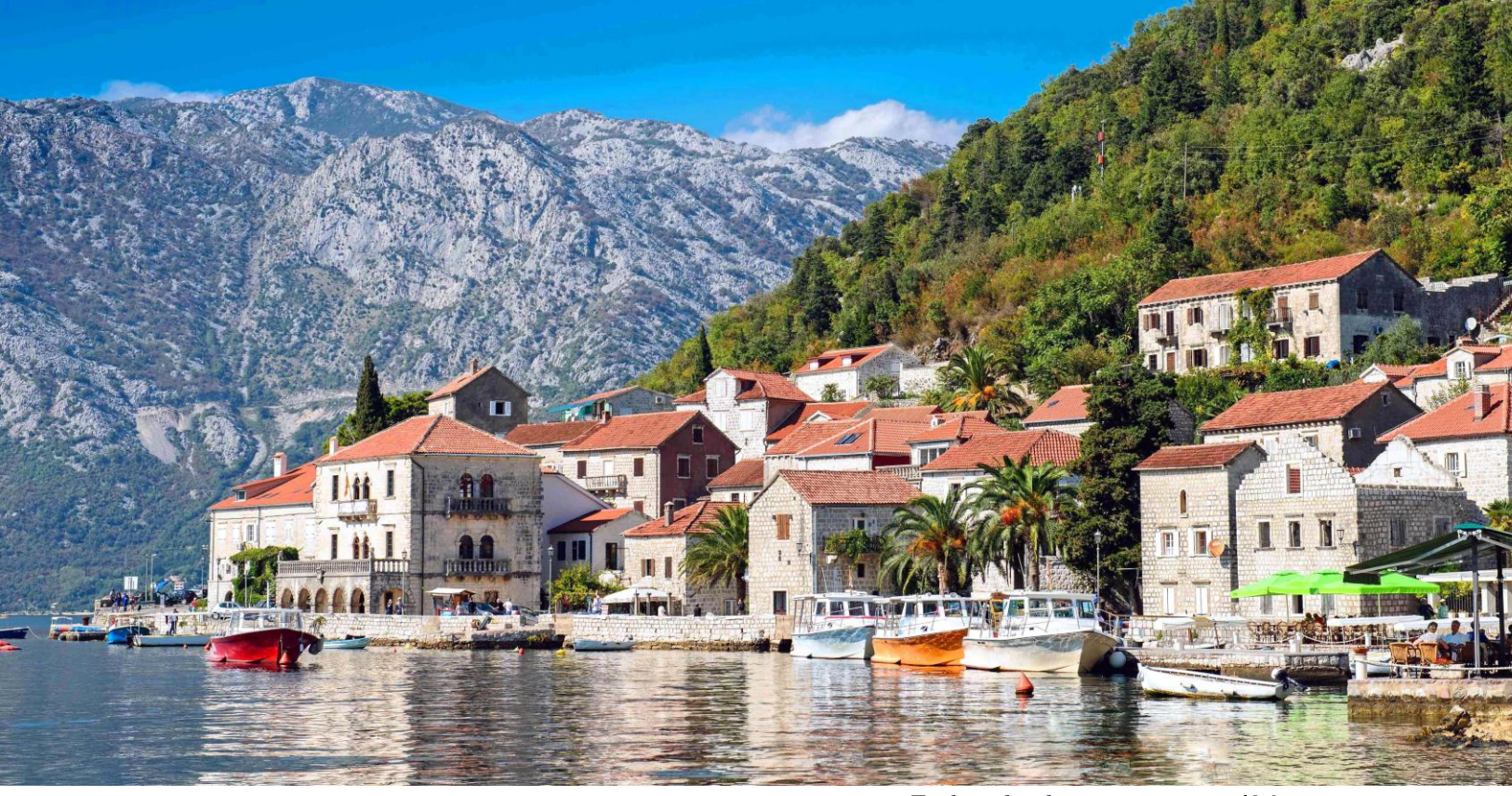
Explore the charming country of Montenegro!