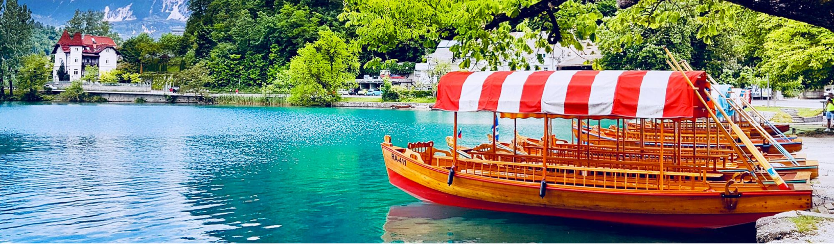
Spend a day exploring Lake Bled, Slovenia