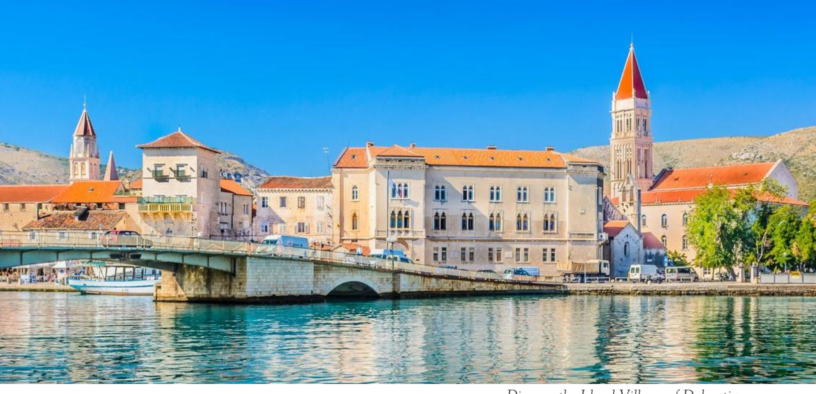
Discover the Island Villages of Dalmatia