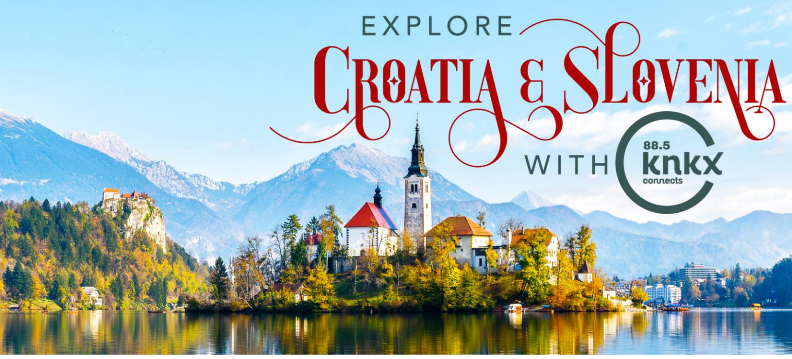
Your Journey Begins on Lake Bled, Slovenia