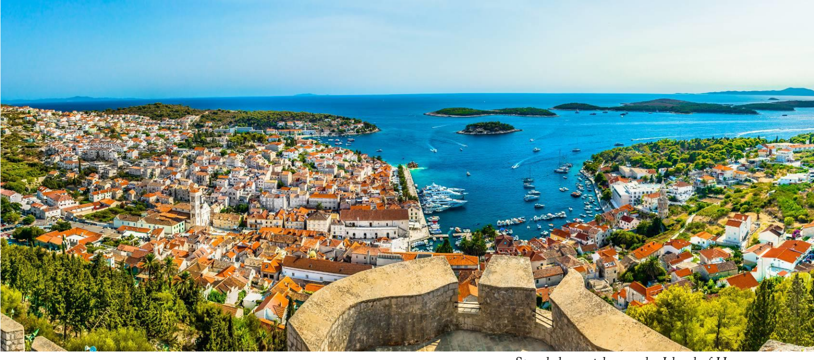
Spend three nights on the Island of Hvar