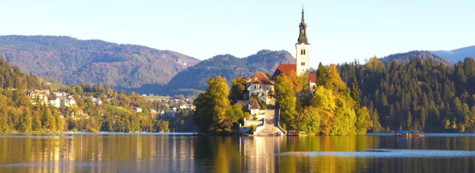
Lake Bled, Slovenia