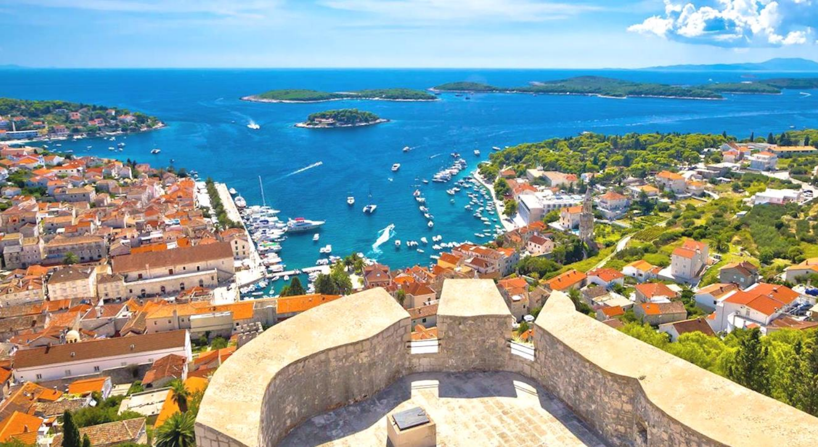
The Venetian Island of Hvar!