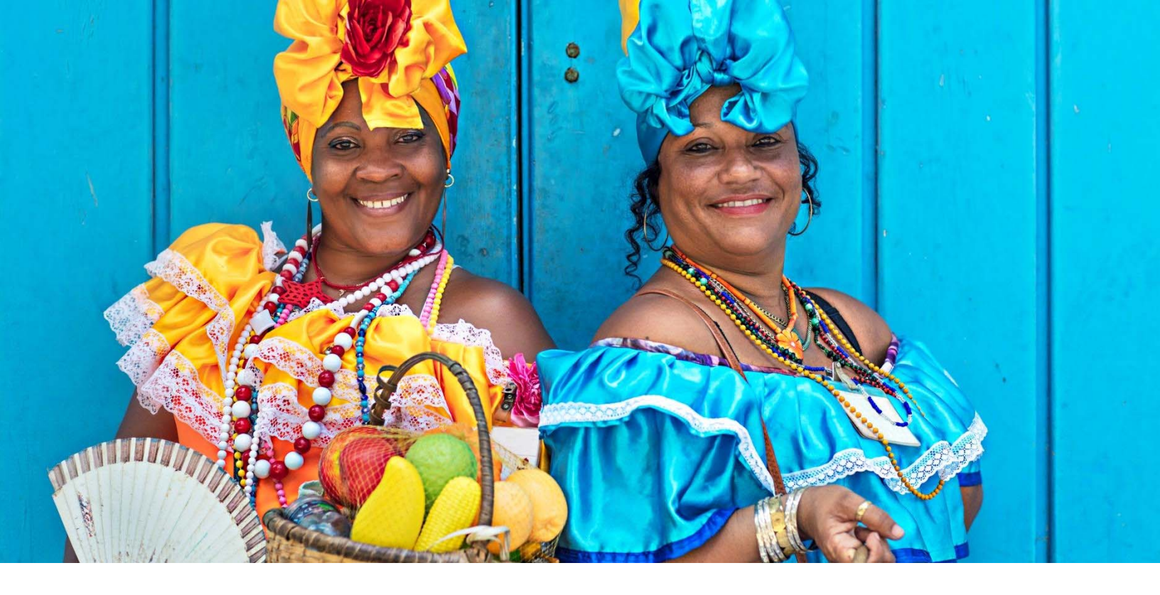
Day 5: Wednesday, January 29 - In Support of Woman in Cuba and Music

This morning we'll head off to visit the Beyond Roots project - a platform to promote Afro-Cuban culture. We'll learn about a few amazing small businesses driven by Cuban women including: Ciclo Papel, an ecological project that transforms recycled paper; Zulu, and a leather bag line craft shop.