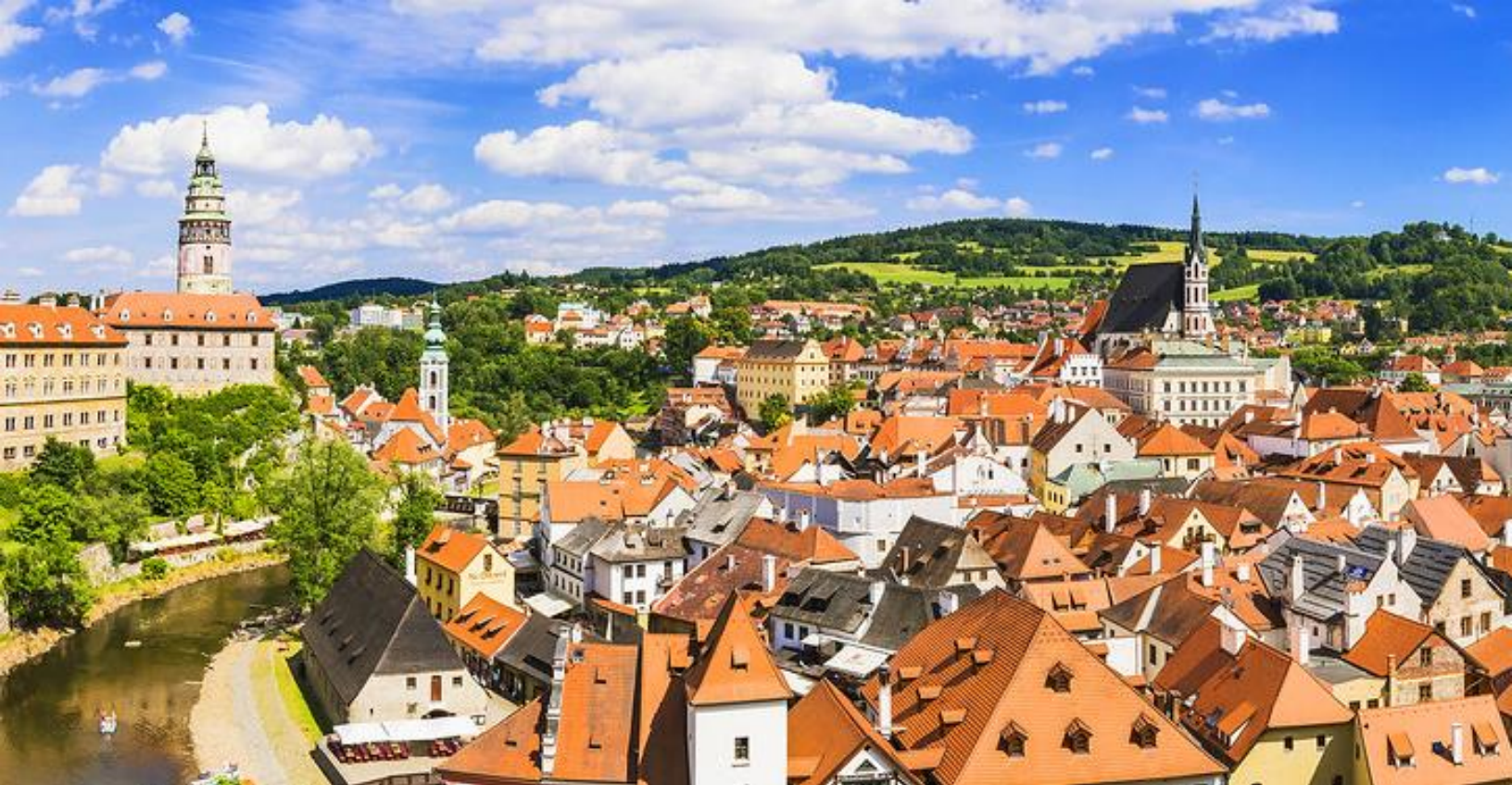
Enjoy lunch in the picturesque town of Cesky Krumlov