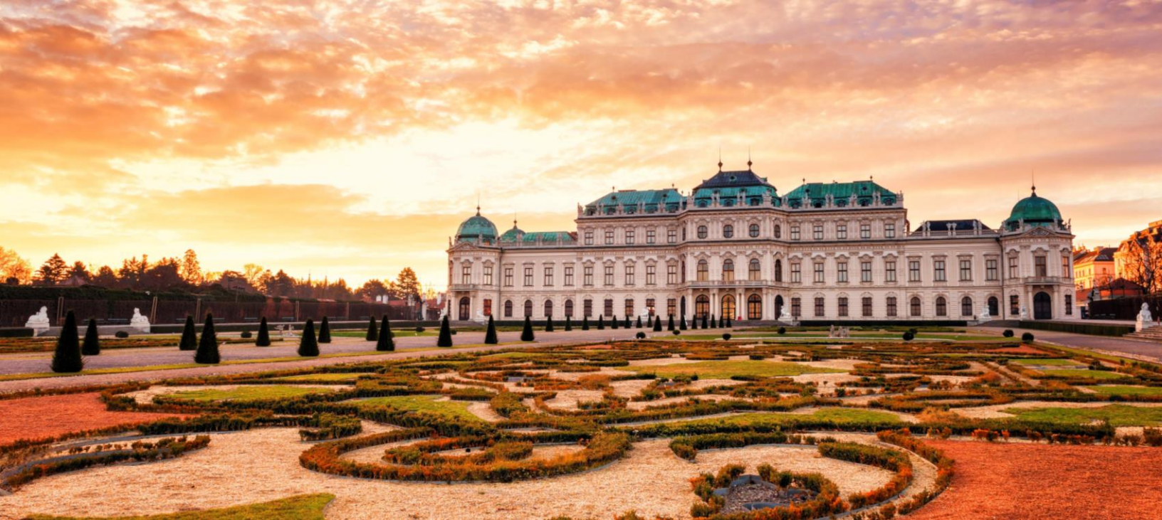
Experience the best of Vienna!