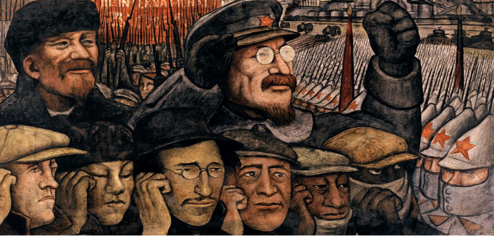
Tour the Diego Rivera Murals

The Catedral Metropolitana (Metropolitan Cathedral) looms over the square and is actually the largest cathedral in all of Latin America. Showcasing a range of different architectural styles, it's possible to go inside and take a look at the ornate ceiling and stained-glass windows.