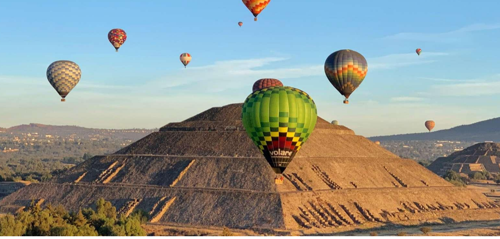
Balloon over the Pyramids (optional)

After lunch, we venture to the charming Coyoacán neighborhood, a quiet, green suburb located a short distance from the center of the city. A rainbow of colonial-style buildings line leafy cobblestone streets in this bohemian neighborhood, with an artsy vibe and gentle pace.