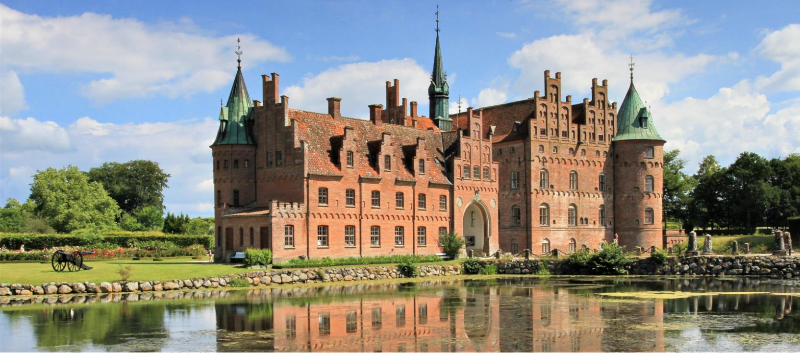
Discover the castles of Denmark!

“Life itself is the most wonderful fairy tale.”