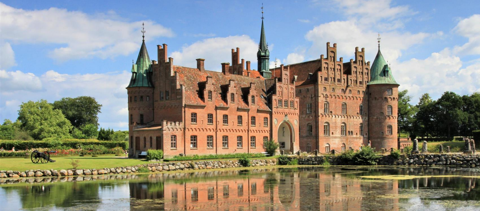
Discover the castles of Denmark!

“Life itself is the most wonderful fairy tale.”