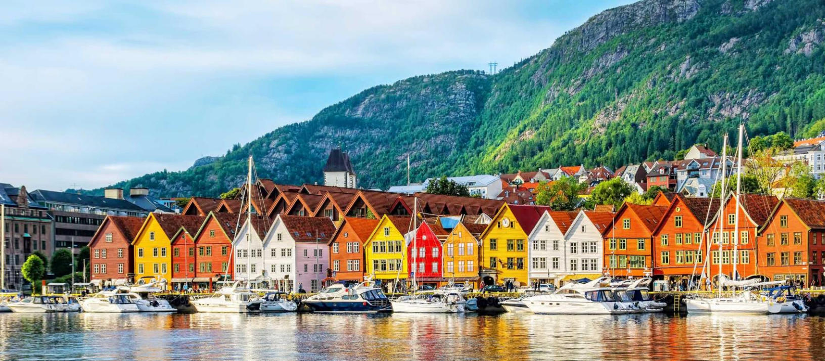
Explore Bergen, Norway