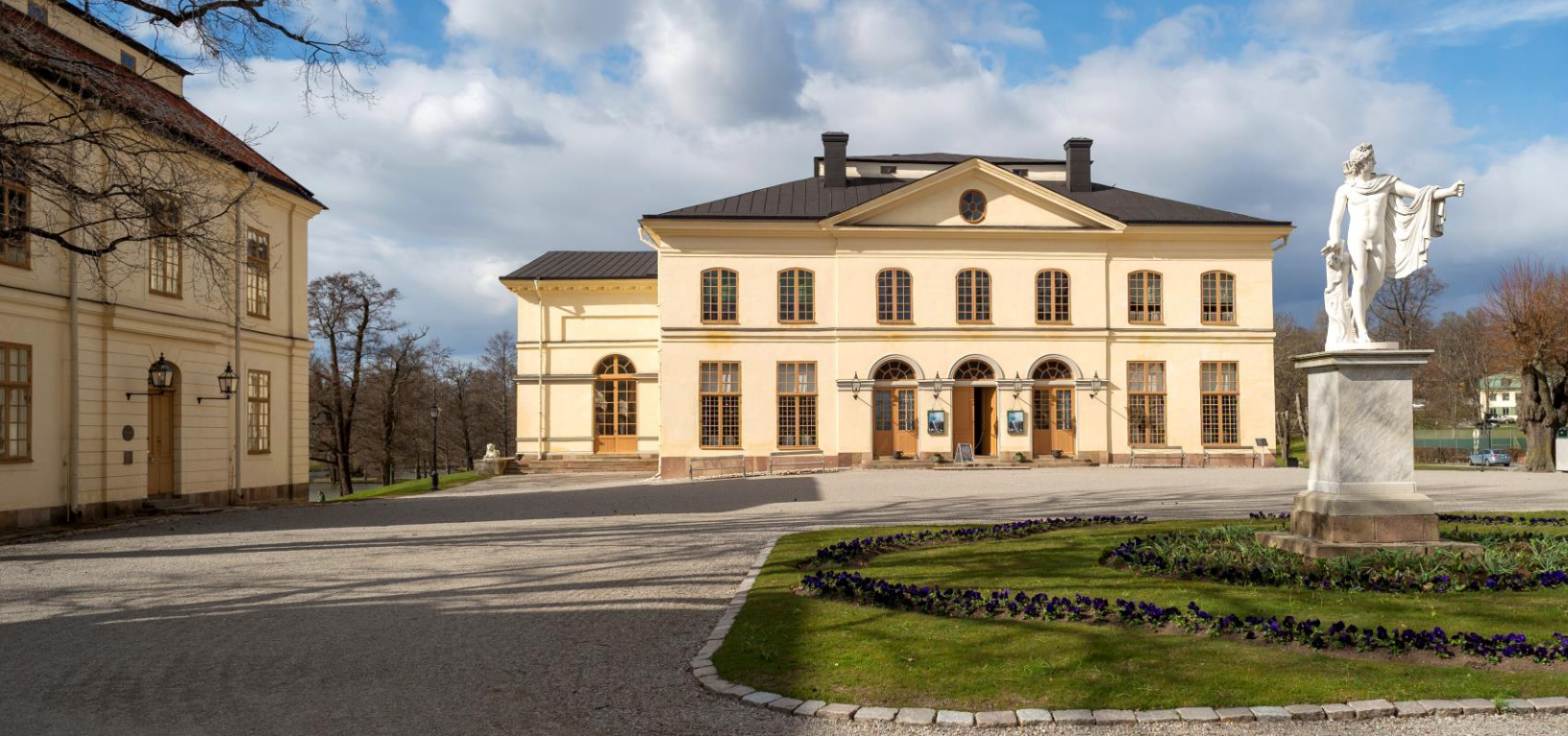
Tour the 18 th century Royal Palace Opera House, Stockholm.