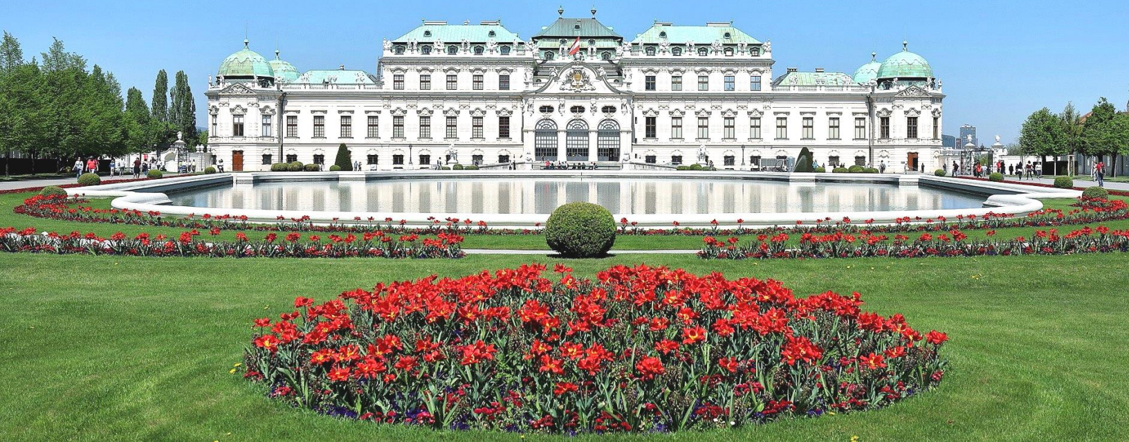
Explore the Gardens and Belvedere Palace