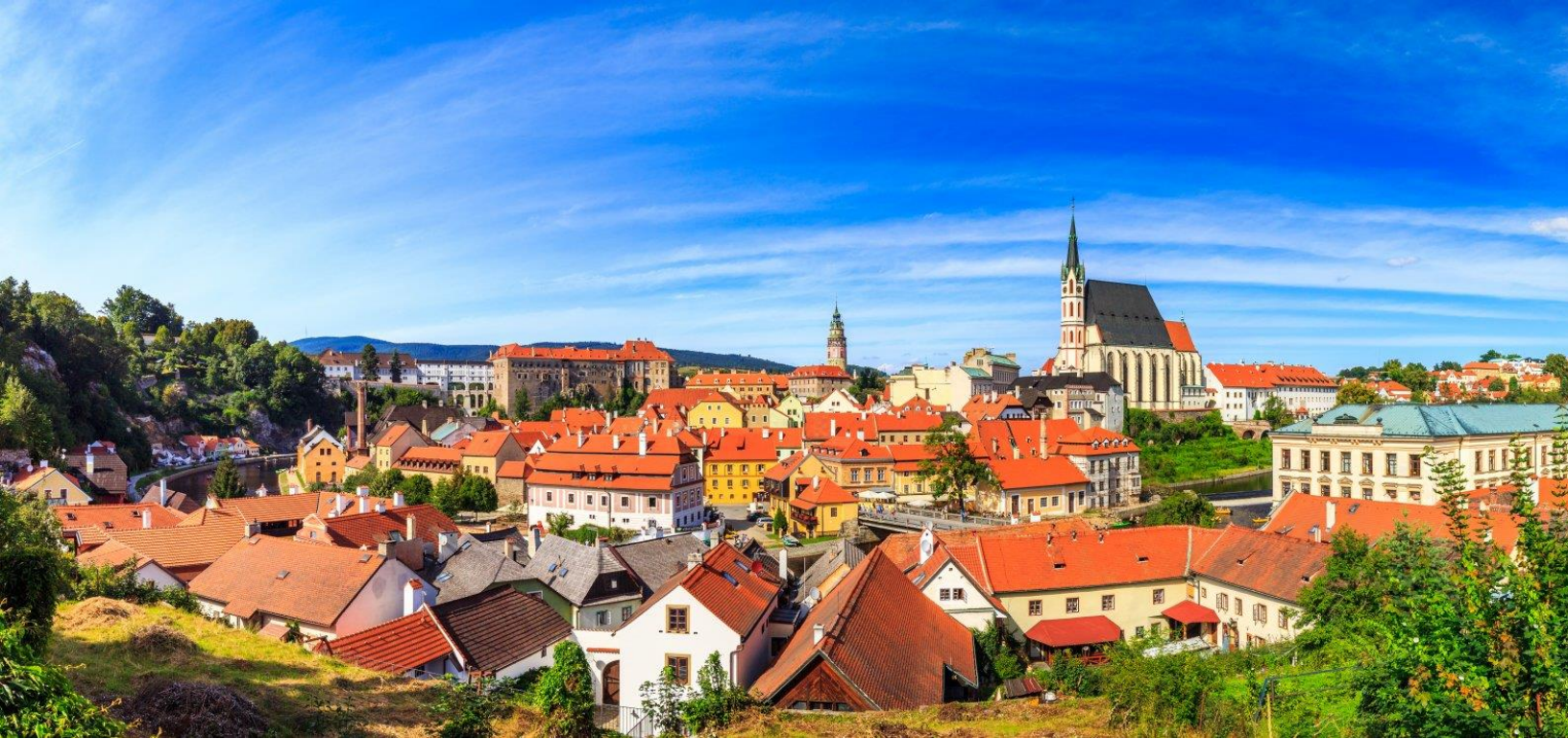
Spend a Day in the Village of Cesky Krumlov