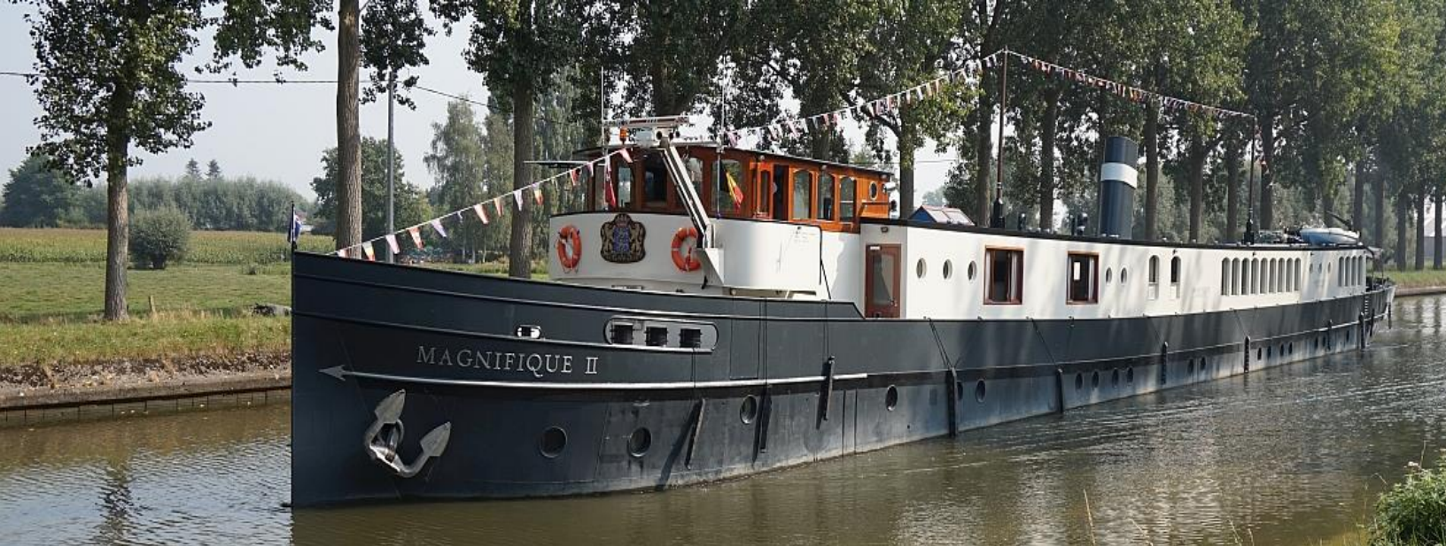
The 1st class, lovingly restored MS MAGNIFIQUE II

Stroll Gouda's local market and join a visit to the cheese-weighing house, De Waag, where you will sample some of the appealing varieties. Yes, there is more than one kind of Gouda! We'll have lunch on board and continue along the canals toward Gouwsluis, a small Dutch town, renowned for its historic vertical lift bridge and also home to the futuristic Steekterpoort building, the facility which controls all of the 24 moveable bridges in South Holland. You may choose to take a bike ride through the nearby countryside, or just relax and enjoy the scenery. After dinner on board, enjoy a presentation and tasting of locally-crafted Dutch beers. Sleep on board (B, L, D)