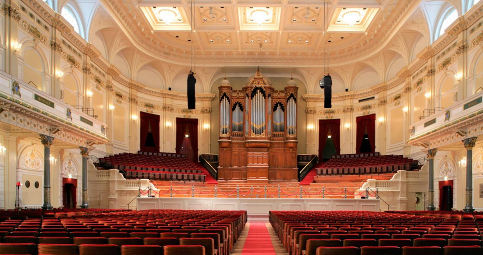
Discover the renowned Concertgebouw Symphony Hall

"God created the world, but the Dutch created the Netherlands."