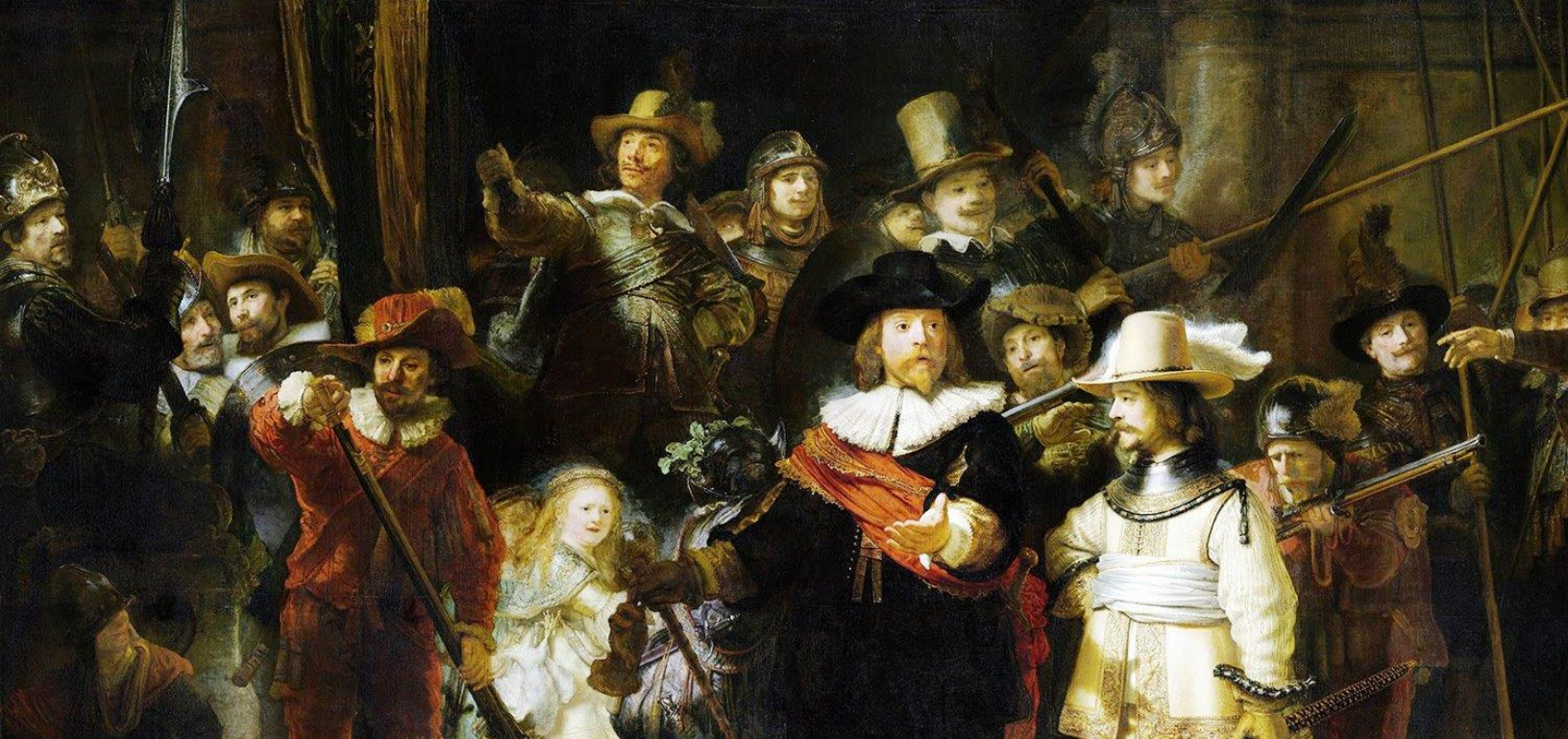
View the Night Watch, by Rembrandt, 1642