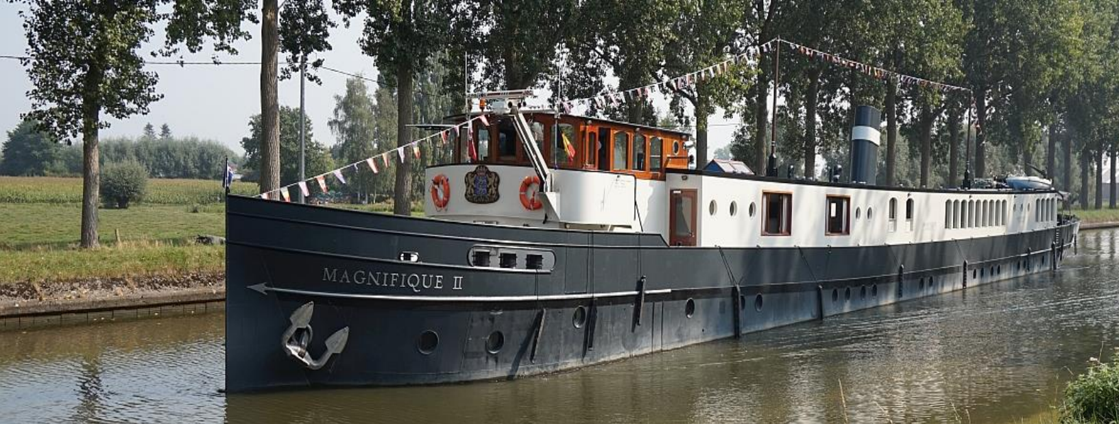
The 1st class, lovingly restored MS MAGNIFIQUE II