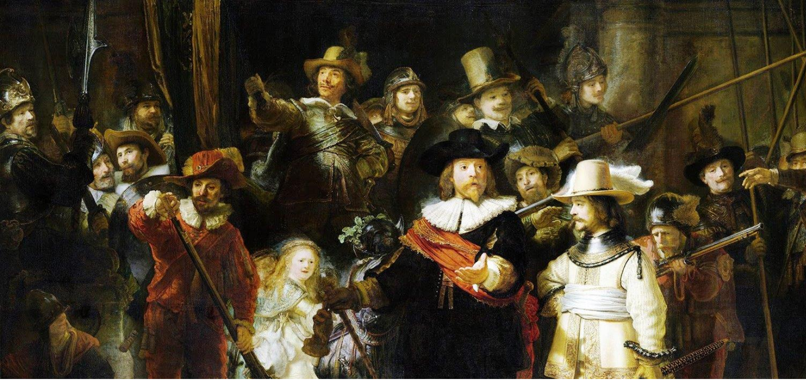
View the Night Watch, by Rembrandt, 1642