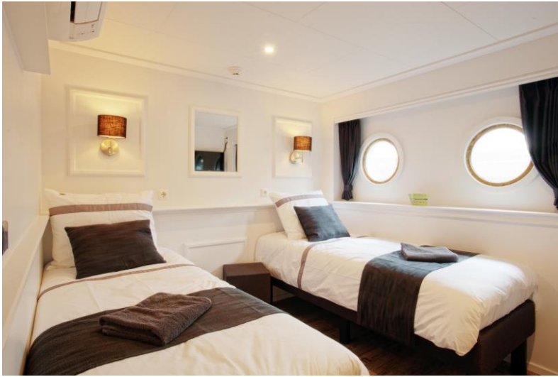
All cabins are bright and spacious. Each comes equipped with bathroom and shower. Lower Van Gogh deck cabin (photo left)