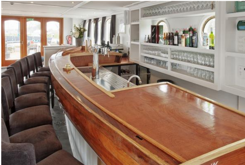
Bar and dining: A great place to relax & commune with fellow travelers

Enjoy wonderful multi-course meals in the elegant dining room