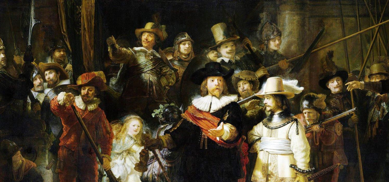
View of the Night Watch, by Rembrandt, 1642

“God created the world, but the Dutch created the Netherlands.” Old Dutch Saying