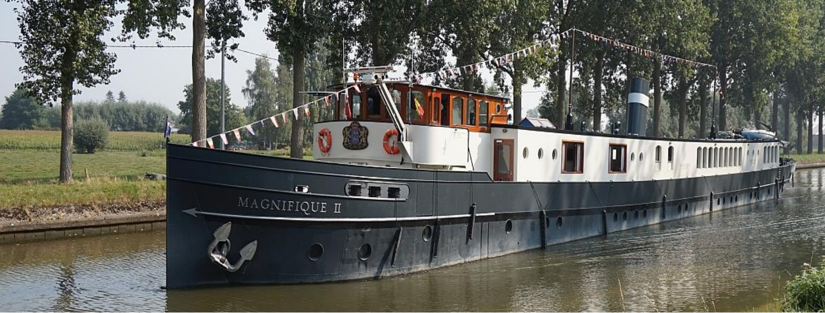
The 1st class, lovingly restored MS MAGNIFIQUE II