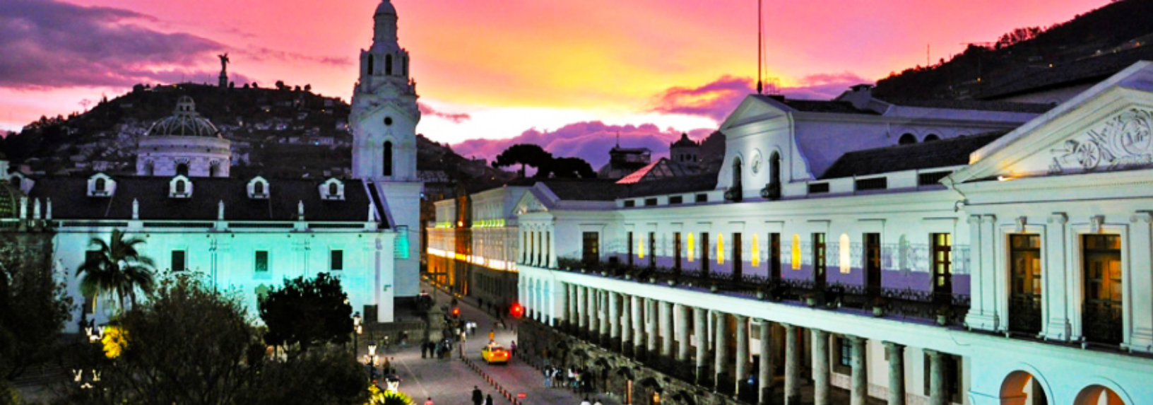
Discover Quito's historic center