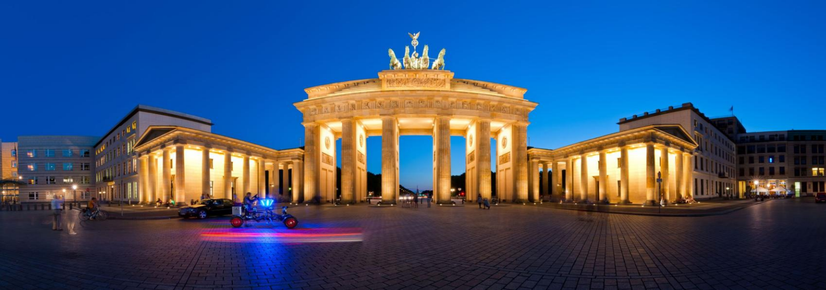
Unter den Linden, Brandenburg Gate