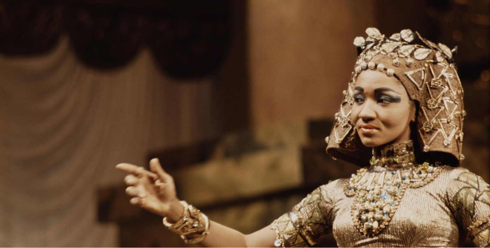
Enjoy Verdi's Aida, in an ancient Roman arena!