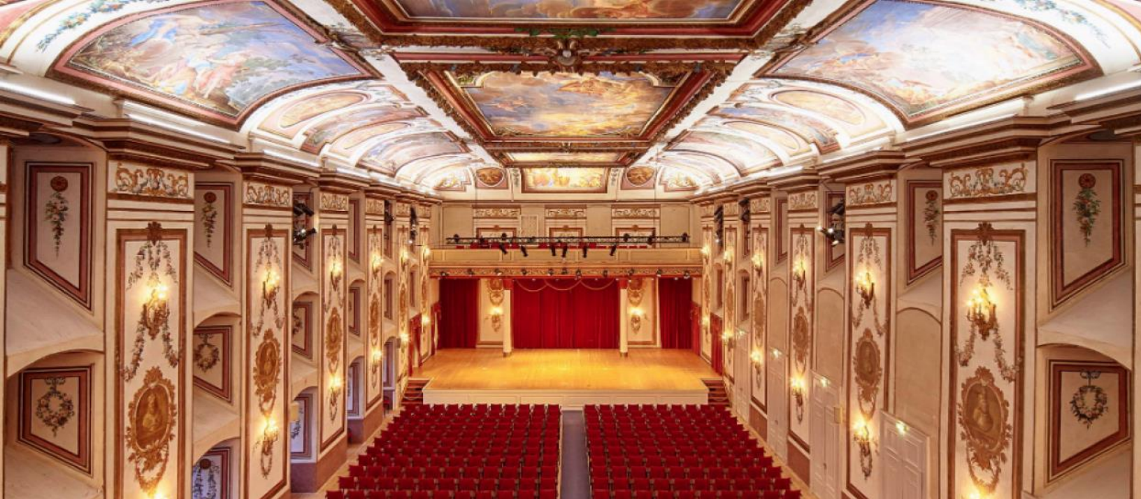
Haydn's Theatre, Schloss Esterházy