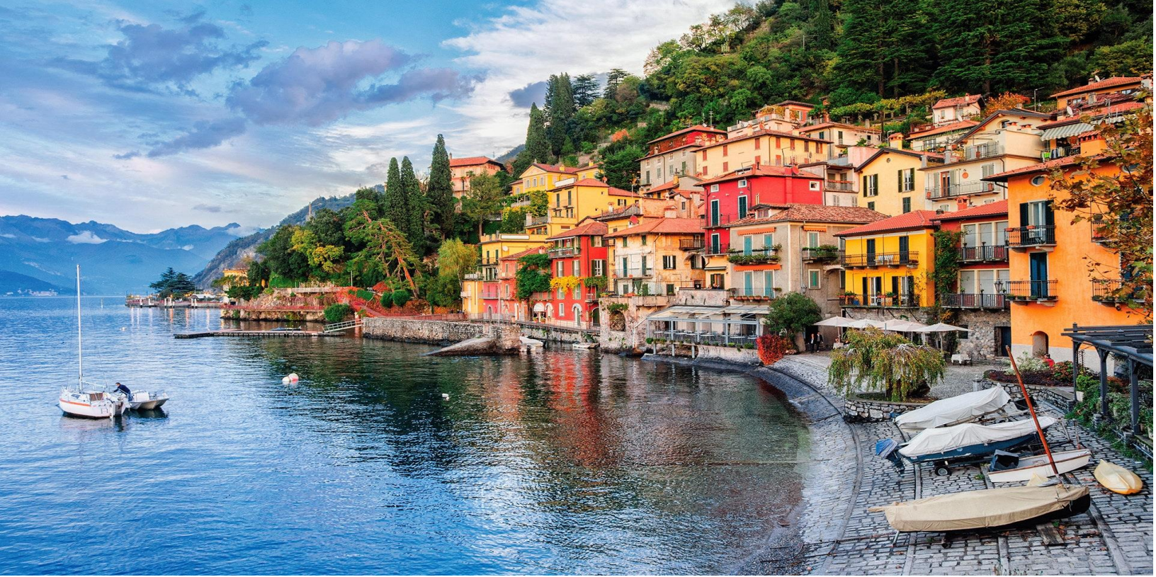
Enjoy two nights on stunning Lake Como

Today is ideal for scenic ferry rides, lakefront village hopping and, if you have the energy, hiking up to medieval castles. Your guide will escort you to the village of Bellagio and offer up a comprehensive orientation before setting you free to explore this elegant lakefront town at your own leisurely pace. Those of you who love gardens you might wish to tour the Villa Cipressi and the legendary, Botanical Garden of Villa Carlotta.