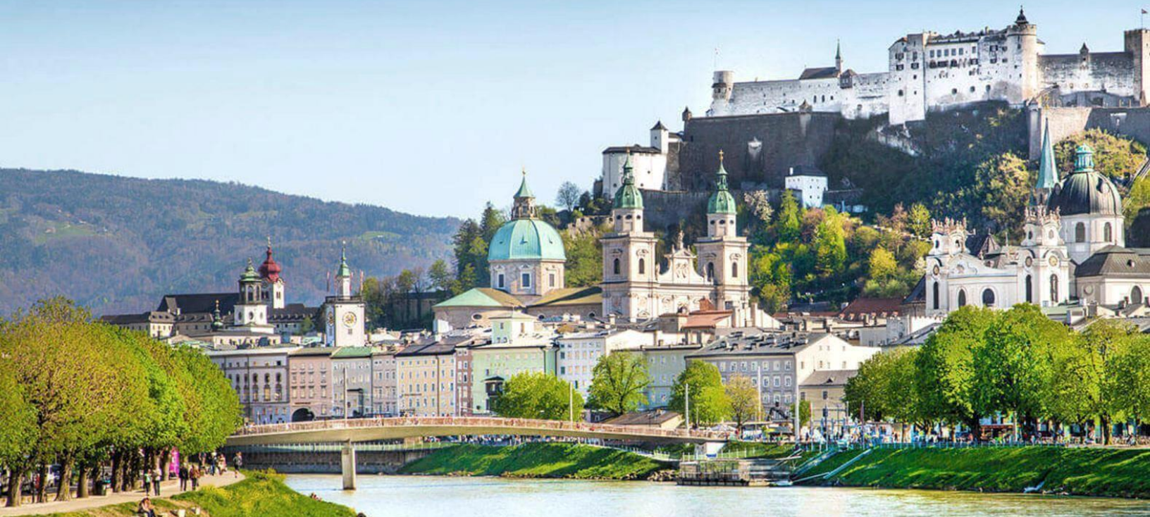
Walk in Mozart's footsteps, Salzburg