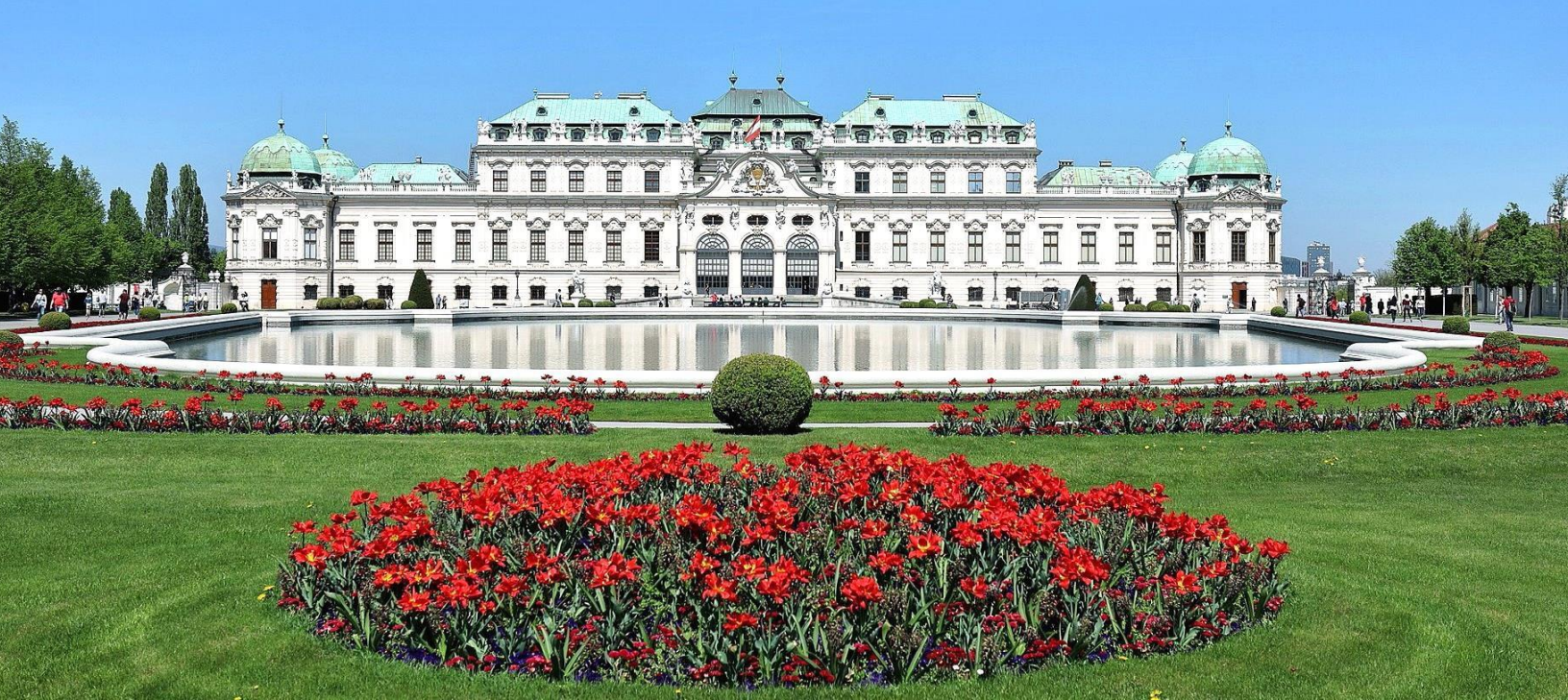
The Belvedere Museum Gardens and the Botanical Gardens