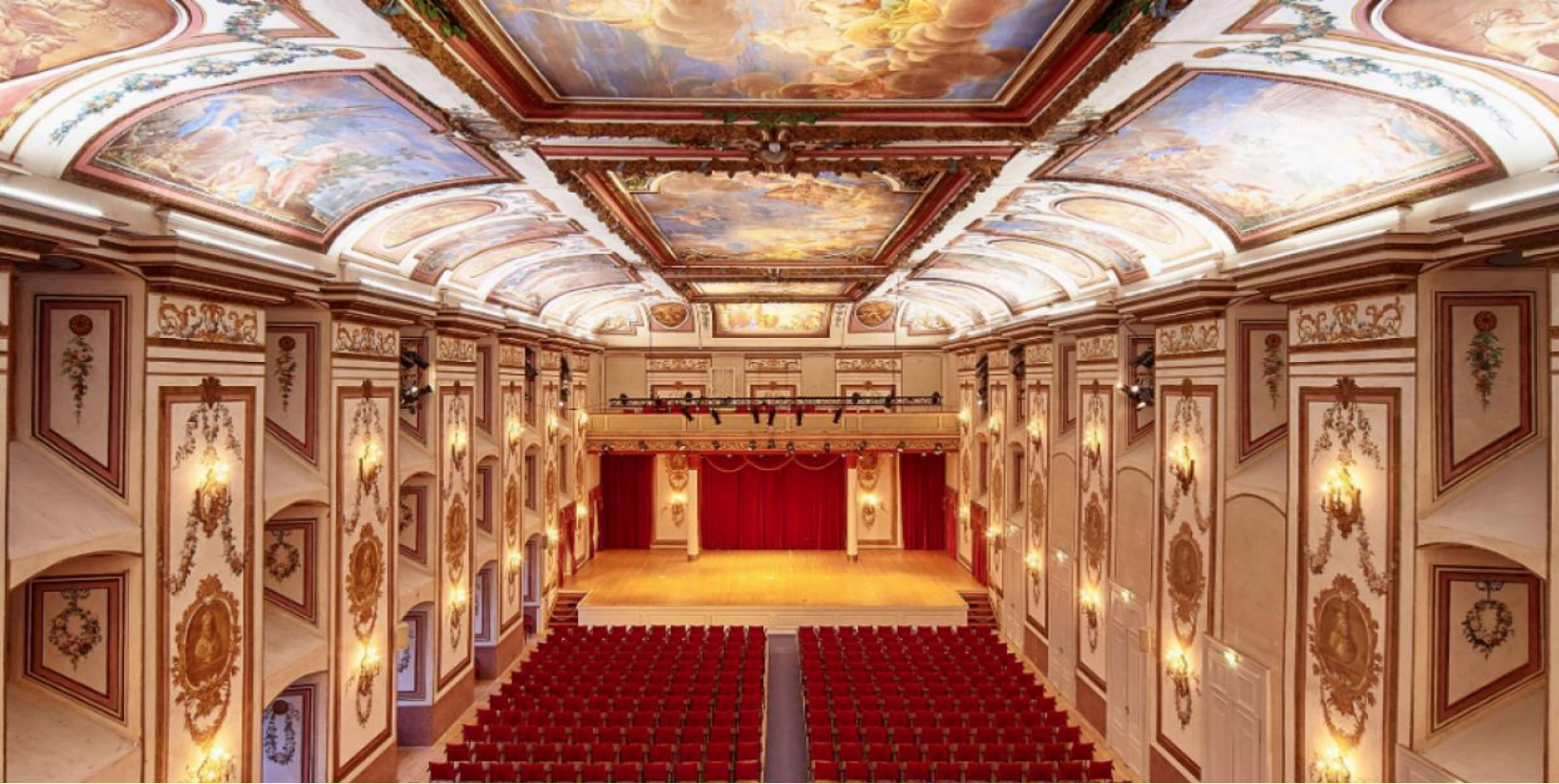
Haydn's Theatre, Schloss Esterházy