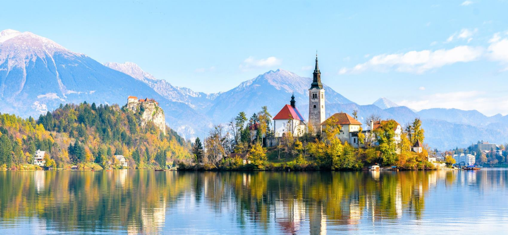
Discover stunning Lake Bled, Slovenia!