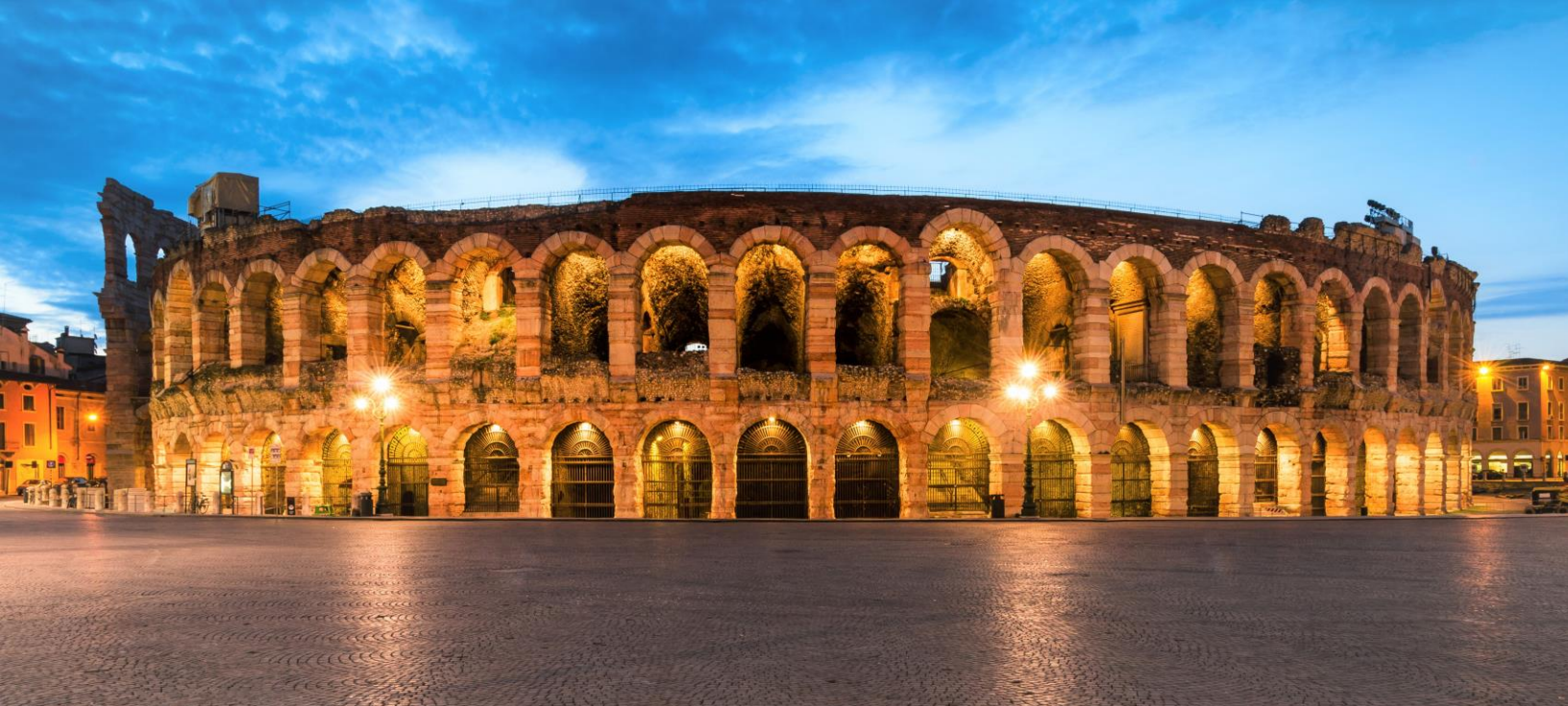
Attend two operas in the Roman Arena of Verona