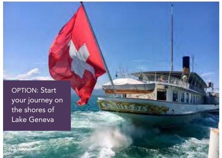
OPTION: Start your journey on the shores of Lake Geneva