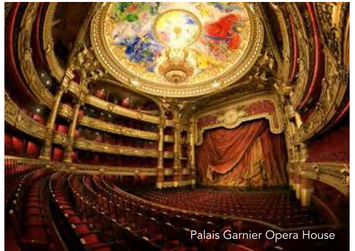
Palais Garnier Opera House