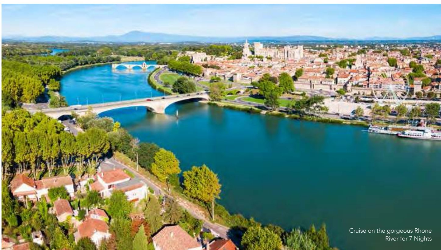
Cruise on the gorgeous Rhone River for 7 Nights