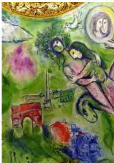
Detail of the Palais Garnier ceiling painted by Marc Chagall

Enjoy a special tour of the Palais Opera Garnier! A 19th-century architectural masterpiece, the Palais Garnier Opera House, built by Charles Garnier and opened in 1875, is the 13th opera house in Paris since the introduction of French opera by Louis XIV in 1669. Napoleon III commissioned it as part of the renovation works in the capital carried out under his command by Baron Haussmann.