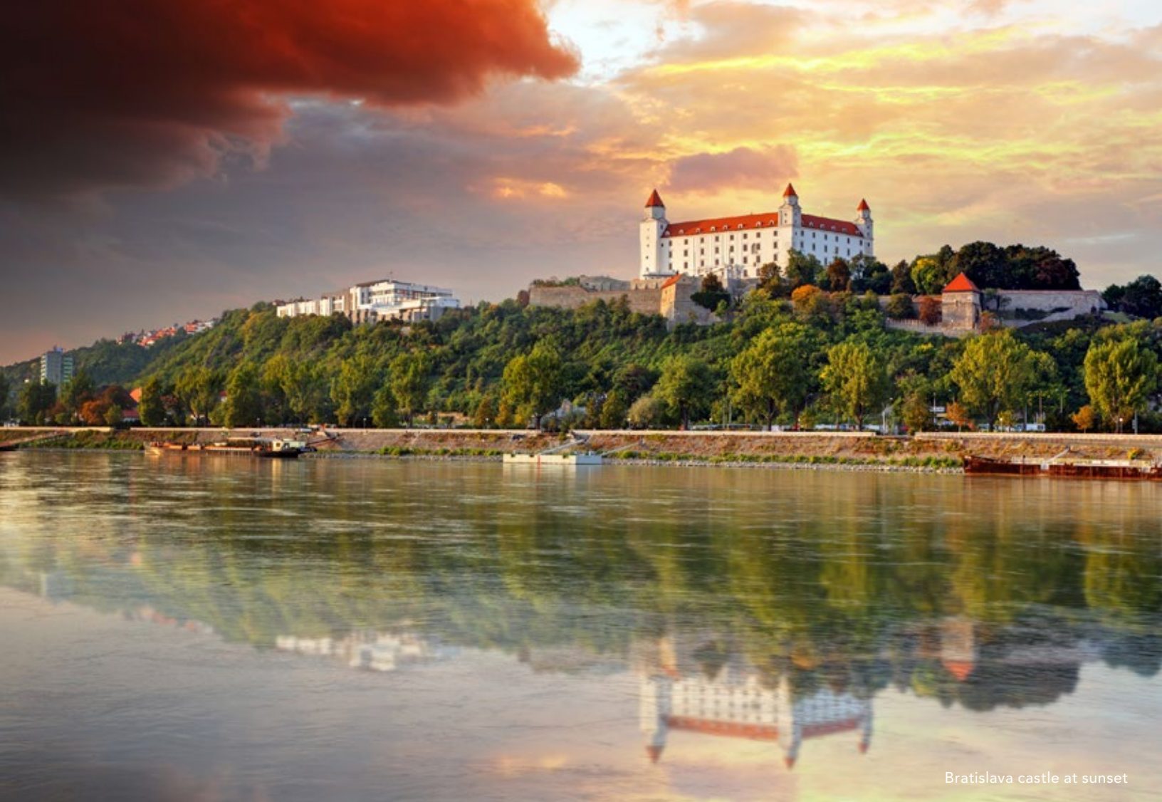
Bratislava castle at sunset

To reserve your space call 800-723-8454 or visit www.earthboundexpeditions.com