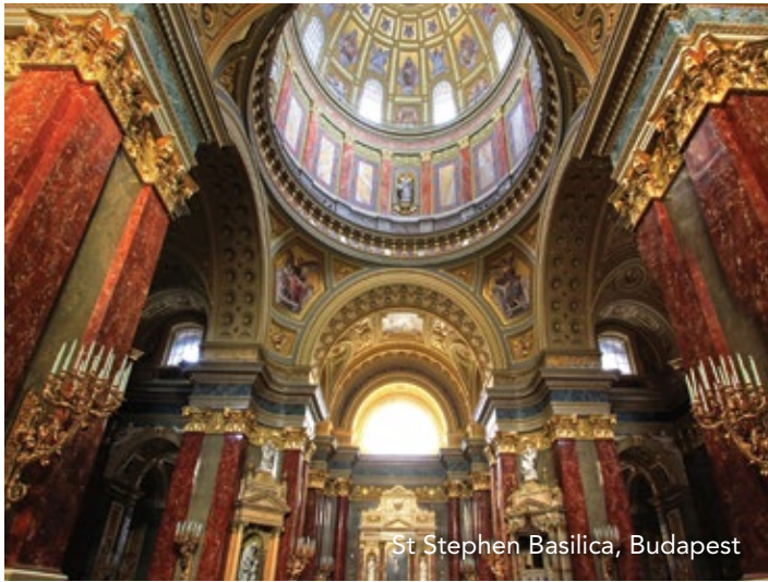
St Stephen Basilica, Budapest