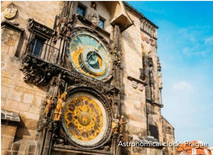
Astronomical clock, Prague