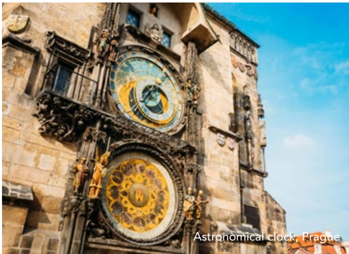
Astronomical clock, Prague