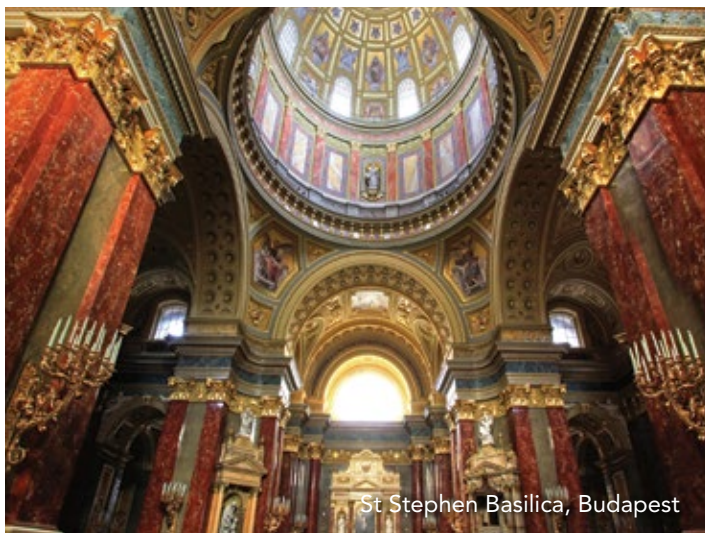
St Stephen Basilica, Budapest