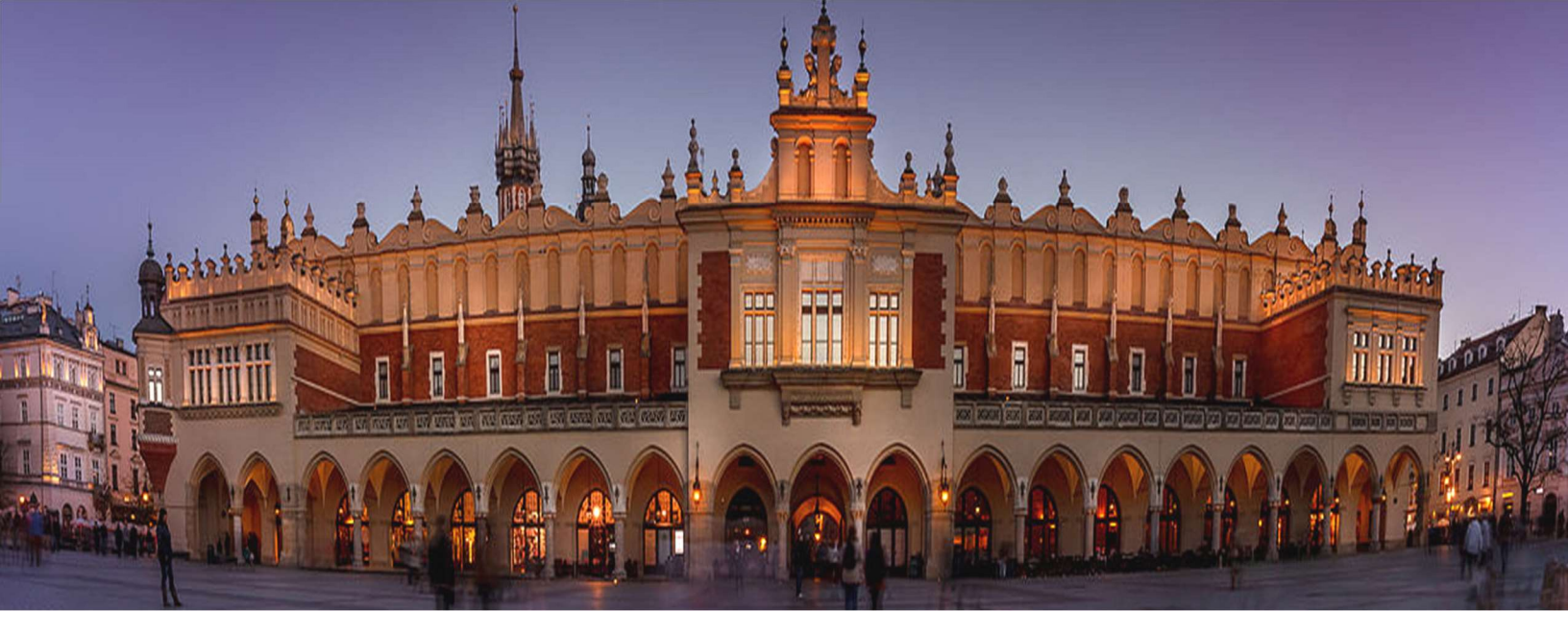
Explore Historic Krakow