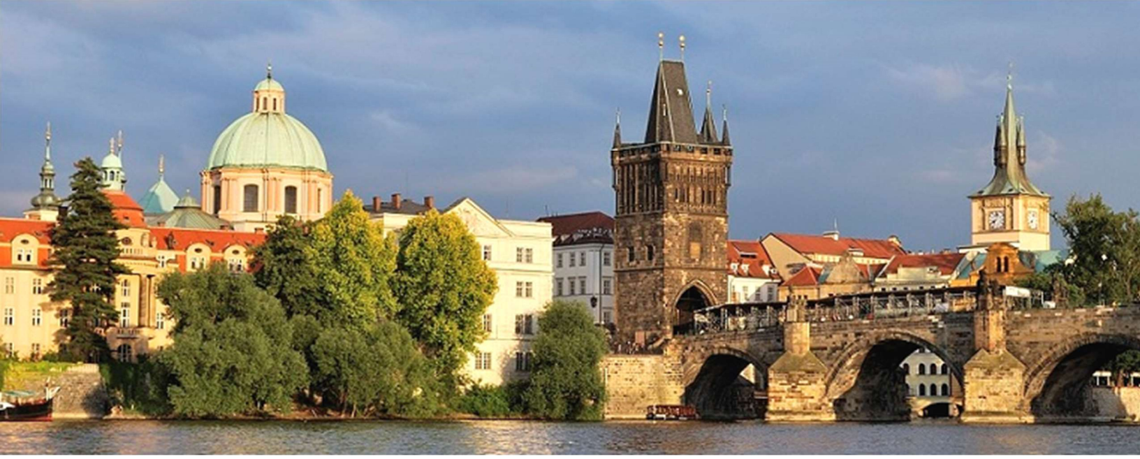
Charles Bridge, Prague